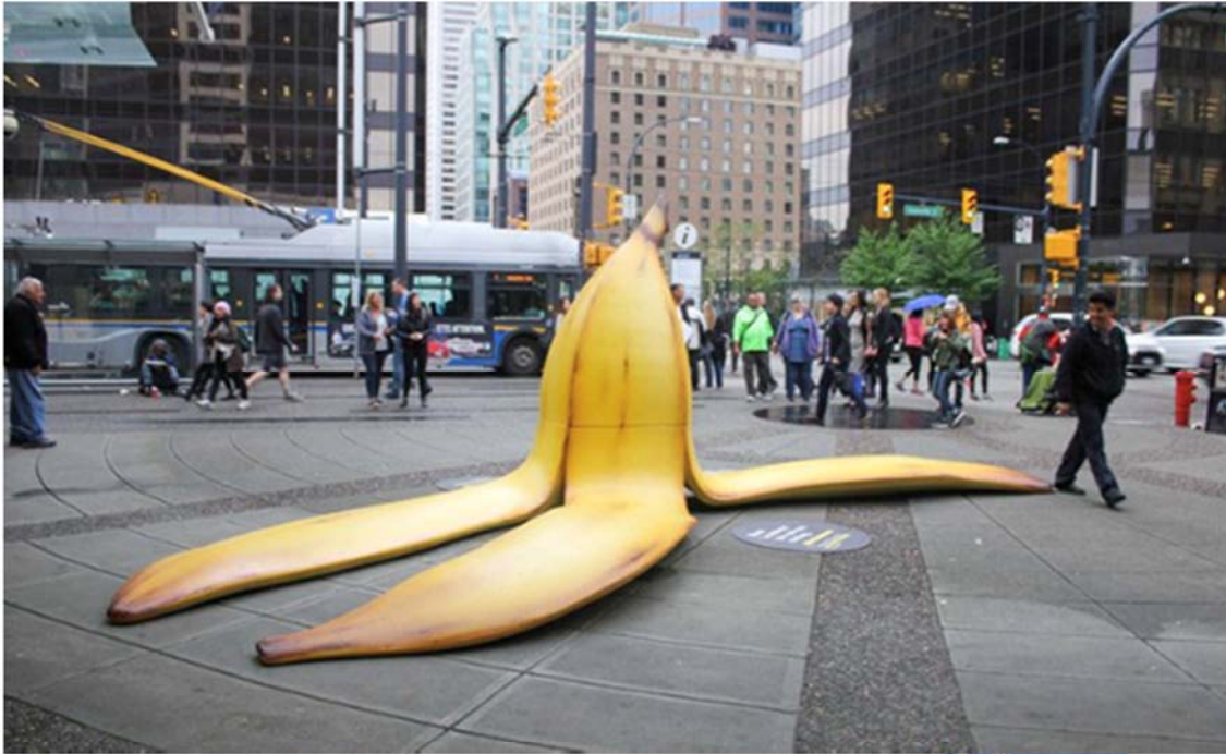
EXHIBIT 3 Preventable Public Displays