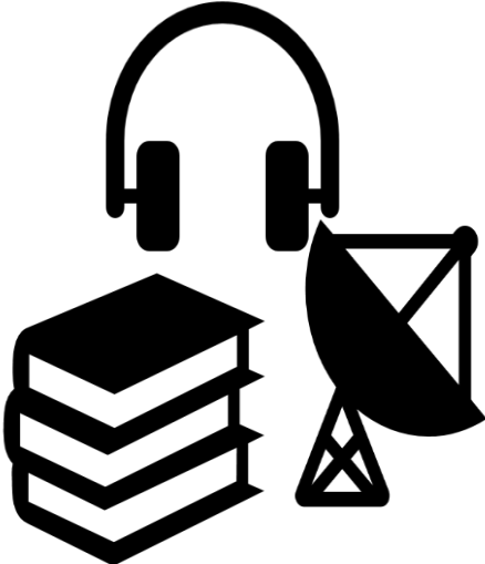
Information & Media Studies