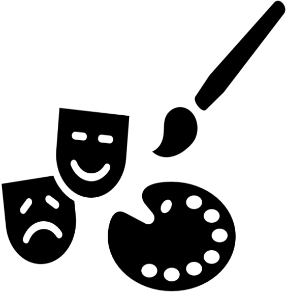
Arts & Humanities