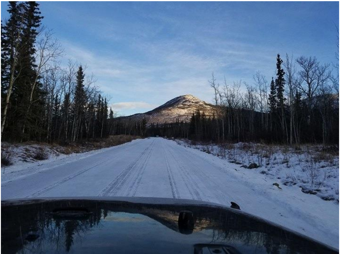
Plate 4: Jeep Hood Reflections

tongued description distorts different elements or different ways of looking at the same space, but none are incorrect or invalid. Much like Polo’s Venices, multiple Whitehorses exist as well. There exists a Whitehorse of excess, luxury, and shops stuffed with artisan treasures; reflected in this Whitehorse is its foil—where tight-lipped social workers watch on as a soon-to-be-homeless person vacates a unit they can no longer afford. Mirrored in the metropolitan, “Yuppie” Whitehorse—where I stumbled across an art gallery opening and had glasses of Cabernet Sauvignon thrust into my bewildered hand—the “Wilderness City” stares back.