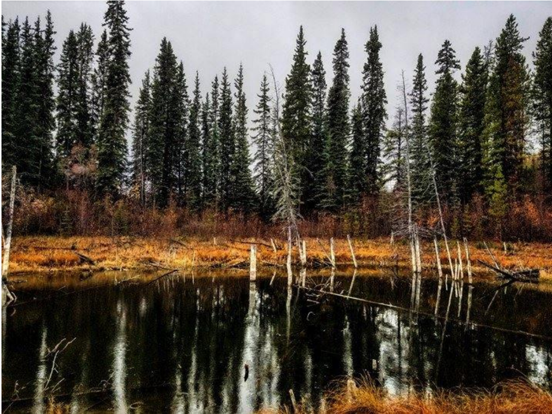
Plate 7: Fish Lake

because both situations apply simultaneously. Like any other province or territory, local political, historical, social, and economic realities make everyday life and politics look slightly different, while still operating under federal guiding legislations.