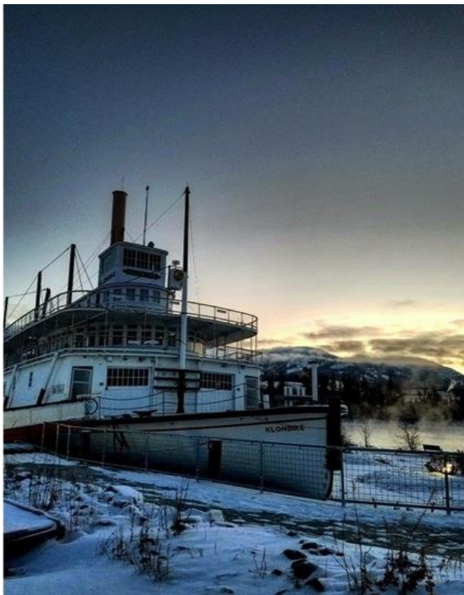
Plate 3: S.S. Klondike at Dawn

Italo Calvino, in Invisible Cities , demonstrates the ways in which multiple meanings and relations can be mapped across the surface of one city (1972). In the book, Marco Polo 12 weaves elaborate tales of all the cities in the empire of Kublai Khan: “however the city may really be, beneath this thick coating of signs, whatever it may contain or conceal, you leave Tamara without having discovered it (14),” or, “it is the mood of the beholder which gives the city of Zembrude its form (66)” (1972). One realizes partway through the book, however, that Marco Polo speaks only of one city—his home, Venice. Each silver-