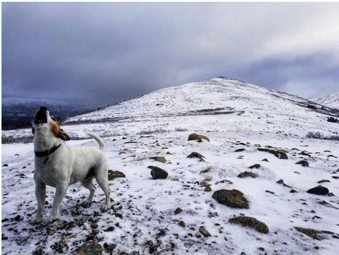
Plate 6: Evening Hike

these questions, I felt quite silly—but think it is worthwhile to keep in mind that a time existed where I did not have such answers.