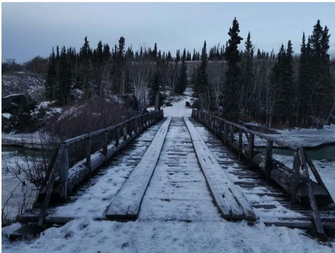
Plate 2: Icy Bridge

In a series of interviews published in 2003, anthropologist and historian James Clifford 11 describes disciplinary borders that anthropology fights to wrestle back ground from: one of these contested boundaries is that where anthropology edges onto the terrain of “travel writing”. On this topic, Clifford suggests the following: