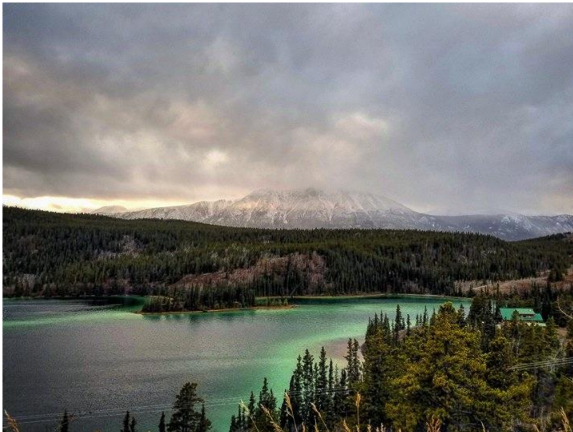
Plate 1: Emerald Lake