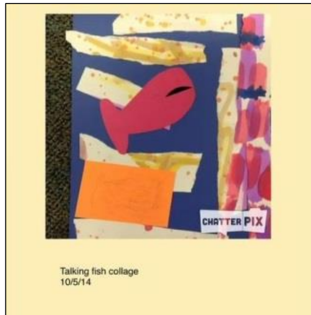
Figure 4. Chatterpix collage

The period before, during, and after making this type of collage suggest some of the affordances of working with the media and the content of the project within the class. This time was ripe with opportunity for intergenerational conversation and collaboration; for example, the participants were invited to respond to a question relating to some aspect of what would be represented in the artwork that day or the medium/media that would be used. In the underwater Chatterpix project, the teacher asked people to share “something that you like to do with water”. The teacher noted that most of the class responded similarly with “swimming”, though the class was surprised when one elder participant said, “wake boarding”. Such surprises elicited smiles and laughs, adding to the joy and mirth of the classes.