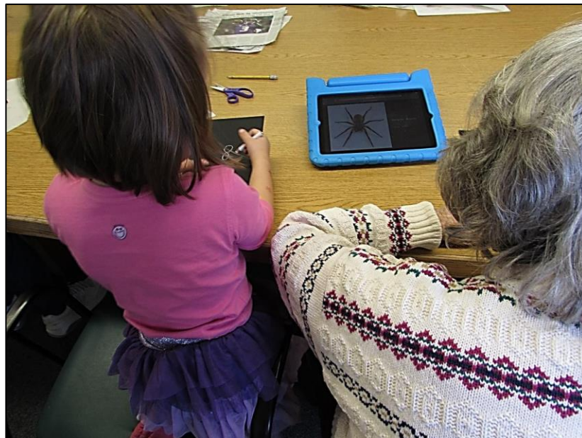
Figure 6. Participants sharing a visual reference

A common phenomenon was this shared use of a mentor text which is also illustrated in Figure 6. This figure depicts an adult and child who were both interested in the same mentor text, elbow-to-elbow consulting it together while drawing. Through the use of this visual reference, the participants were each able to create her own text in tangent.