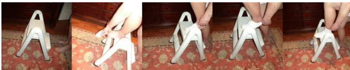
Figure 3: (a–e). Trevor uses a step stool to maintain engagement in dressing.

That's the stepping stool I use to get my socks on. Then the next one is starting my socks. I have to bend over. I get them about halfway up my foot – then, you get the next picture – I have to get on my toe and get them slid up. Then, the next picture is just emphasizing that I have difficulty getting it around my heel. The shorter the socks, the better off. Then, I got the sock up there in the last picture.