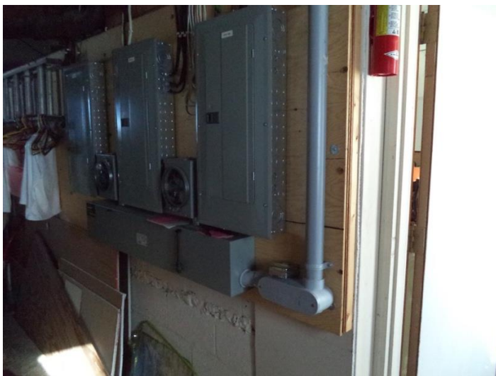
Figure 1: Lawrence’s representation of an occupation he has given up as a consequence of progressing PD.