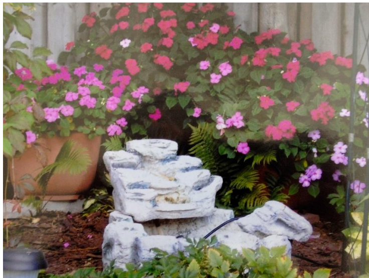
Figure 2: Gail’s representation of a new occupation that she initiated once being diagnosed with PD.

myself, by myself, with no other input.” And that’s how it happened. It just happened. And I surprised myself by being so – strong, I suppose, mentally and physically.