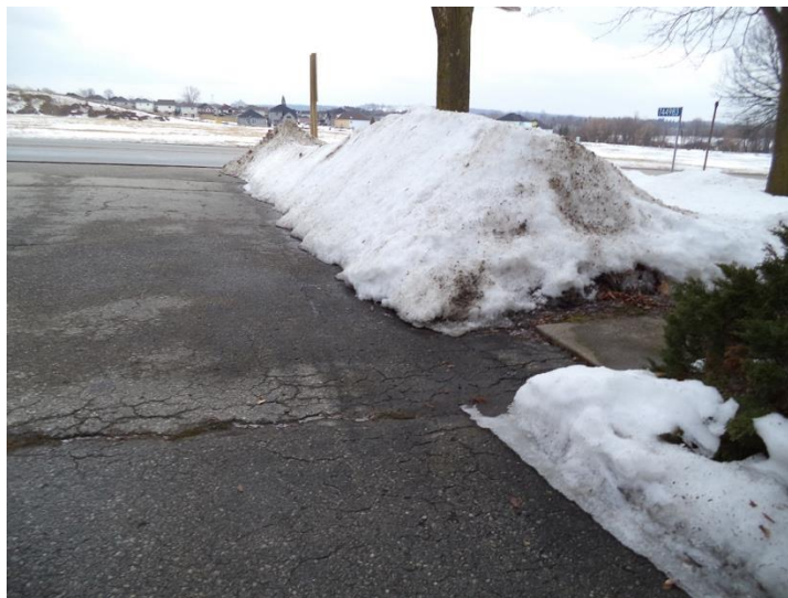
Figure 6: Occupations such as shoveling snow allow Lawrence to see himself as a hard worker.

For Meg, community engagement was key to her sense of identity. At times, transportation posed a threat to gaining access to community activities. For example, she narrated difficulty driving in such conditions as winter weather and in the dark, and described instances where she had to return home because she could not find parking near the entrance of her destination. In order to maintain engagement in community activities, Meg implemented the use of mobility devices and accessibility strategies (see Figure 7). As she explained: