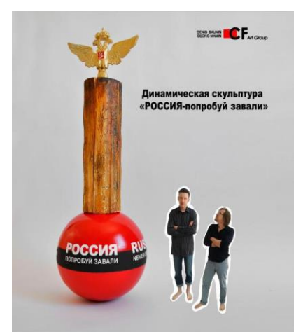
Figure 1. The dynamic sculpture "Russa. Try to kill!" with authors D. Saunin and G. Mamin<sup>4</sup>.

The sculpture, weighing a half-ton and 5 meters high, has a one-and-a-half-meter bright red sphere on the bottom, a trimmed log with a gold two-headed eagle is on the top. It is a dynamic self-righting sculpture, which resists any attempt to knock it over. The slogan is: "Russia – try to kill!<sup>5</sup>" in English a defensive version: "Russia—never overturn."