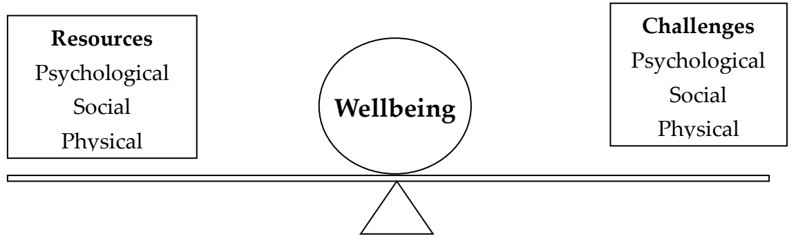
Figure 1. Defining well-being.

The definition of well-being by Dodge, Daly, Huyton, and Sanders (2012) was used in this study as the conceptual model. It assumes a balance between resources and challenges, shown in Figure 1.