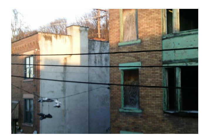
Figure 3. Photograph of and quote about the environmental dimension of health and wellness

When I look out my window, this is what I see. That'll keep me, that there it's depressing. You depressed, you don't want to move...So, that'll keep you from not—that environment will keep you stagnant.