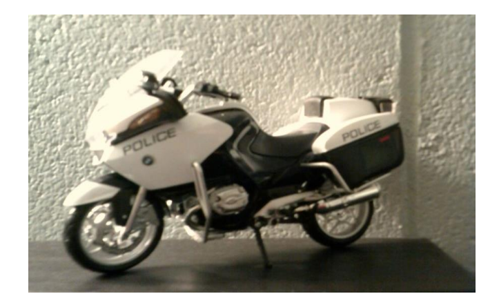
Figure 4. Photograph of and quote about the emotional dimension of health and wellness

I've done [model building] all my life, so it's kind of a hobby. It kind of helps me to be more creative. The doctor says that [it] gives you a sense of accomplishment when you're done....In other words, takes me out of my head. I get into this stuff and while I'm doing it, I don't have to worry about other stuff.