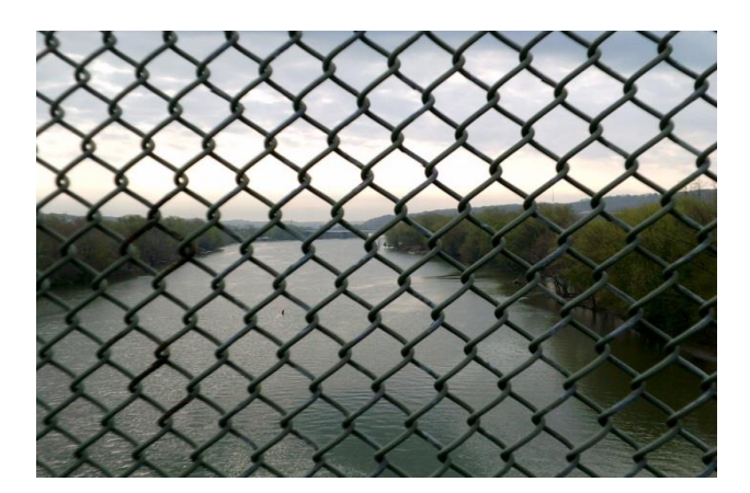
Figure 9. Photograph of and quote about overarching visions for better health and wellness

See this fenced in? This is the good part out there. Down there in the river there then in the distance. Getting beyond this fence is a whole world out there, so I just gotta get around it. Even if I have to walk, get there some kind of way. I gotta make a way. I gotta make some positive moves, positive steps to get there and get what I need to get. I can't be fenced in.