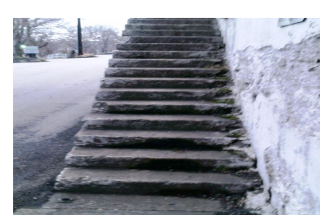
Figure 11. Photograph of and quote about internal obstacles to health and wellness

There's a lot of Veterans out there that's homeless that don't even know how to work the system 'cause they don't know how to get into the system. There's a lot of Veterans out there on the street that don't have the right mindset because they're totally lost. A lot of them don't come [to the VA] because they're homeless, they're shamed. You've got to take the steps to get there. It's going to have be you. Get yourself there and take that opportunity to want to be helped.