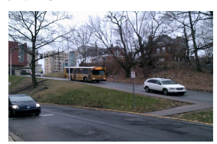
Figure 10. Photograph of and quote about external obstacles to health and wellness

It is sometimes a challenge because I don't have a car. Without a car sometimes I might be out of bus tickets or my monthly pass might run out, and then I'm stuck with trying to get to the [VA healthcare] appointment and then I missed the appointment, and then I just can't, I just don't see, I just let it go.