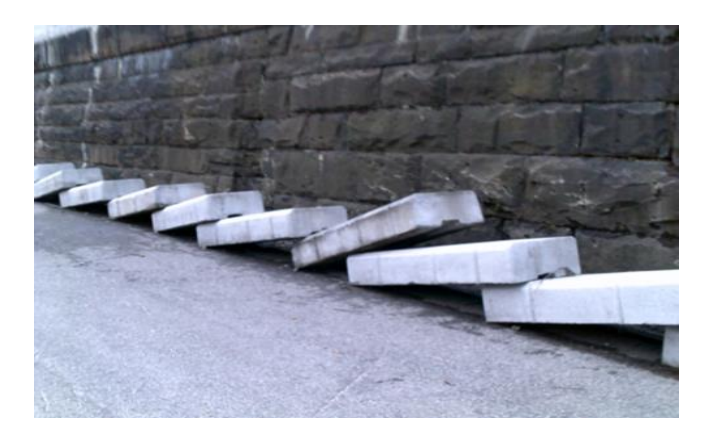
Figure 2. Photograph of and quote about the social dimension of health and wellness

A lot of these soldiers now coming back, they're alcoholics or they're drug addicts. Or both. It's like a domino effect, it's not only just one [soldier], it's several. When it hits one, it hits them like they're in a platoon. For most of the Veterans, if you can get these Veterans together, they'll hang together as long