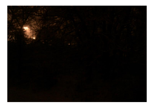
Figure 6. Photograph of and quote about the spiritual dimension of health and wellness

One Veteran described the search for health and wellness as finding a source of light in the darkness that life sometimes offers (Figure 6).