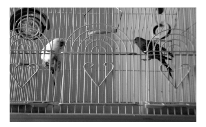
Figure 5. Photograph of and quote about the intellectual dimension of health and wellness

Now I got this book with all the different kinds of birds and...I'm teaching [my grandson] about birds. I like birds. I'm teaching him the names of birds and what they are. And those are my birds! This is Dusty, and this is Bud Light. (laughs) He was light colored and we had another bird that died and...we named Bud so we just called him Bud Light...They are relaxing. So that helps me relieve stress too.