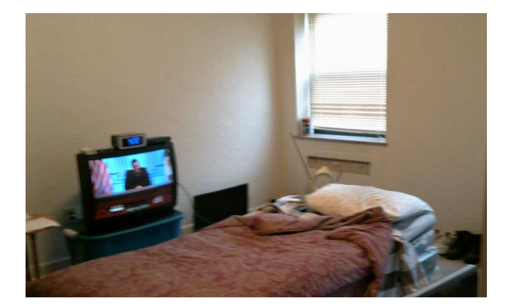
Figure 8. Photograph of and quote about the financial dimension of health and wellness

Even though I can't work no more. I need more money...I can't really hardly work no more. And then when you do work, the check that they gave me, well-now they're trying to sue me for working. They take the money out of the check I guess, starting next year.