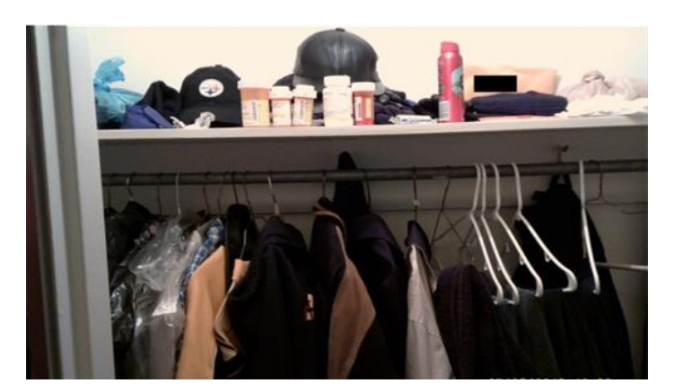
Figure 1. Photograph of and quote about the physical dimension of health and wellness

Because this is where I keep my pills at. I got a little pill container. But, I never forget not to take my pills because every time I take off my coat.