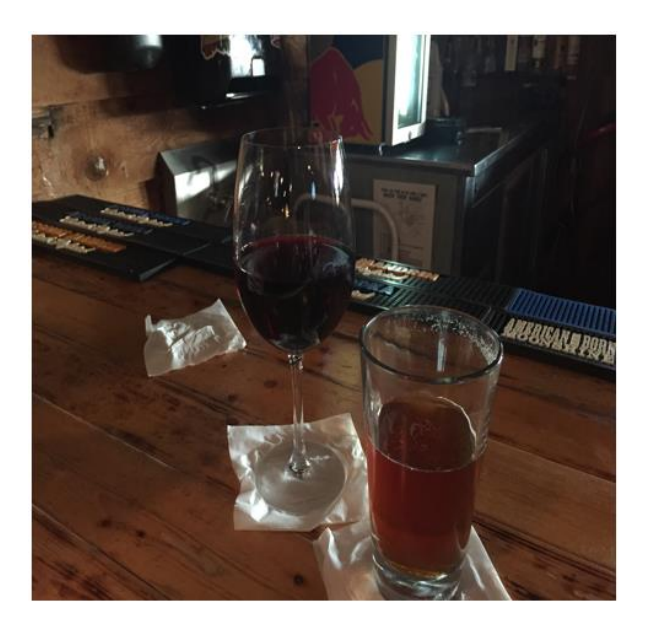
Figure 1: Finding support. This photo represents receiving support and validation of emotions and experiences. The photo was taken by a participant at a local restaurant after spending time with another pre-tenure faculty member.

often valued because of the competitive nature of the tenure and promotion process. This theme of community included the sub-themes of finding support and sense of humor .