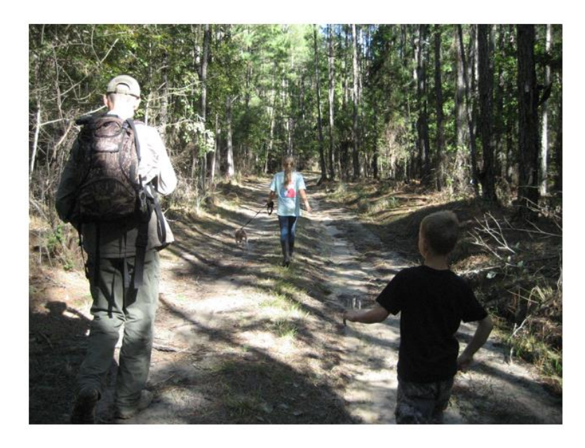
Figure 3: This photo represents the major theme of balance and further highlights the subtheme of maintaining one's values. The participant described the importance of spending time with family as a primary value.

Participant R3 identified hiking with his family as a combination of his values: family, health, and wellness. He described maintaining one's values this way: