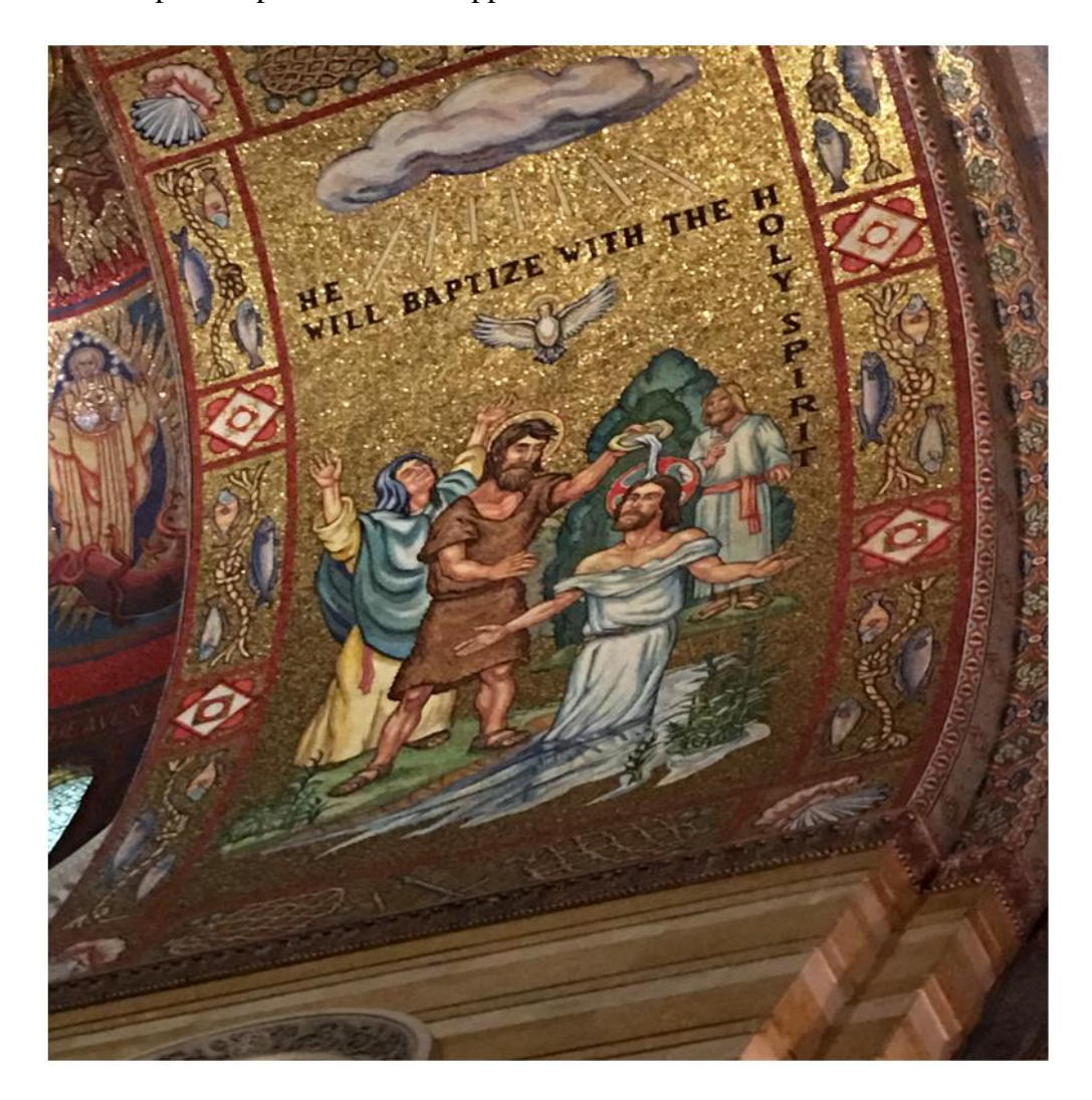
Figure 2: This photo was taken by a participant in the St. Louis Cathedral. The participant remarked this photo inspired her to acknowledge the importance of her faith and how it is a way she finds support.

At times we felt that we missed opportunities to improve our mutual support. This occurred in part because it was difficult to share our individual successes due to the atmosphere of competition around the tenure and promotion process at our university. While we acknowledge that the work we do is collaborative in nature, which is a positive aspect of the pre-tenure pathway, we realized that we tend to keep our overall accomplishments to ourselves. Furthermore, as junior faculty, we go up for tenure in what feels like a competitive environment and one must outshine the other. Thus, we were able to see how vital it has been for us to find and accept multiple sources of support.