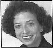
The Honorable Deborah Wasserman Schultz

Florida House of Representatives Davie, Florida