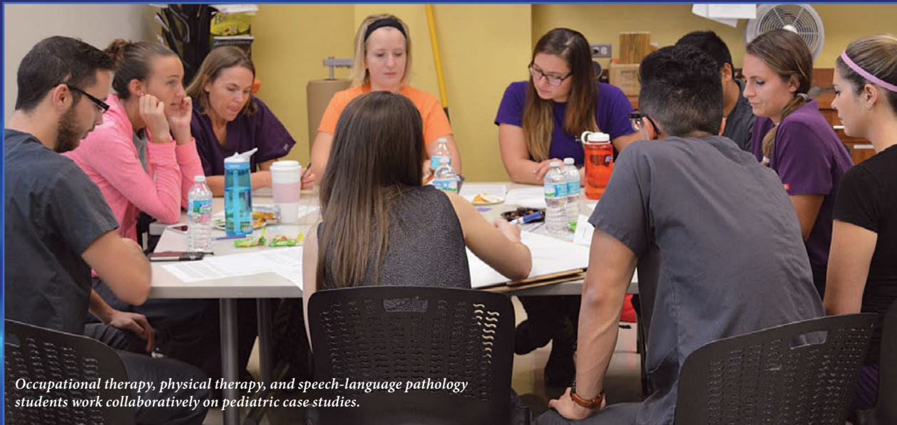
Occupational therapy, physical therapy, and speech-language pathology students work collaboratively on pediatric case studies.