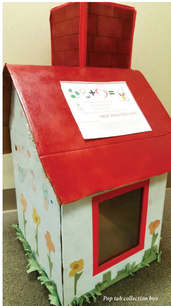
Pop tab collection box