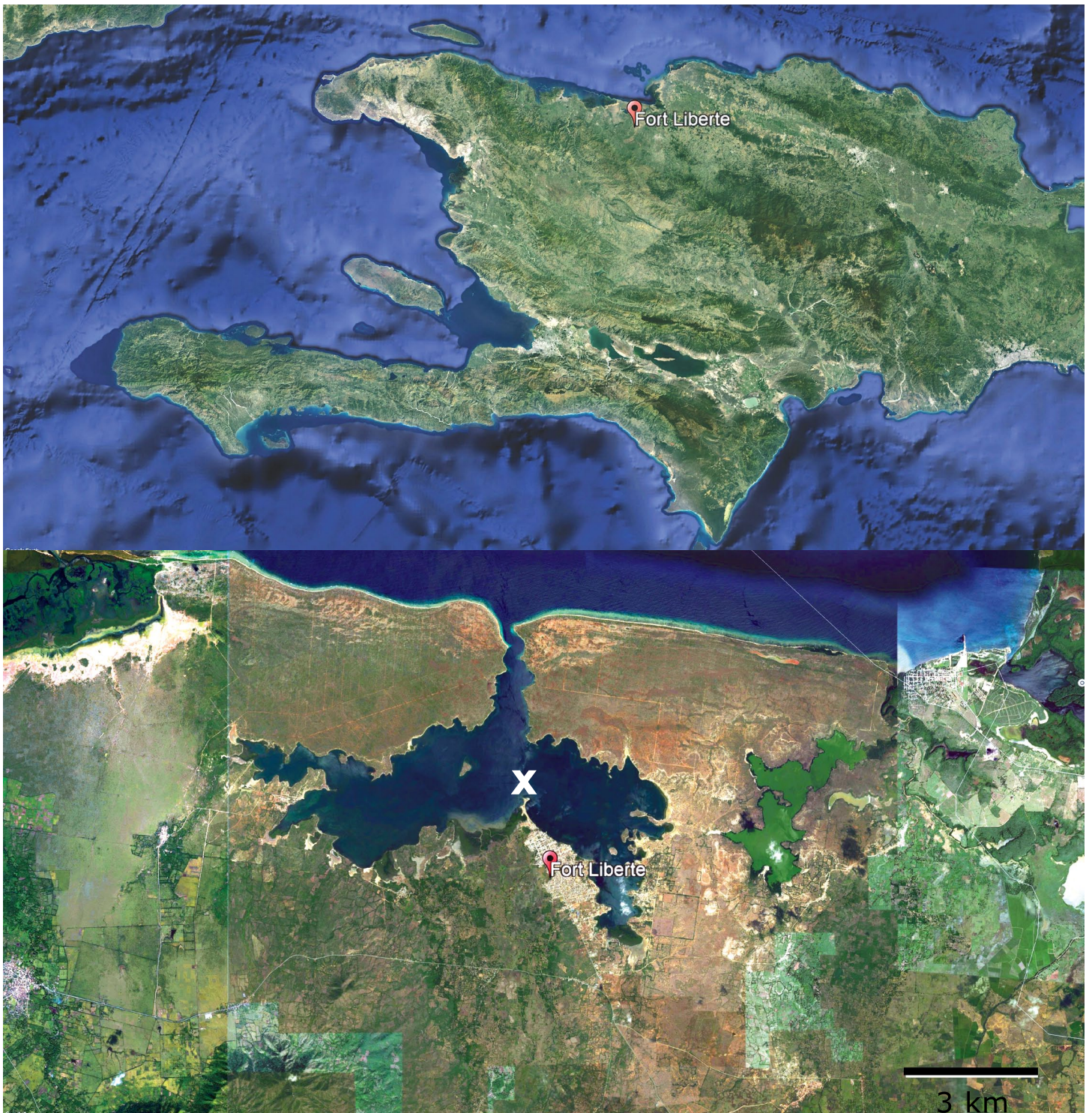
Figure 3. Type location for Hypoplectrus liberte , Fort-Liberté Bay, Haiti: map of Hispaniola (above) and map of Fort-Liberté Bay with Fort-Liberté town indicated; X= the collection location at 19.677°, -71.843° (Google Earth).

KU986285) was shared with specimens of several hamlet species from Bermuda, Florida, Bahamas, Cuba, Puerto Rico, Belize, Panama, and Curaçao; the second haplotype (paratypes KU986298 and KU986293) with specimens from Belize and Panama, and the third paratype (KU986282) was a close unique haplotype.