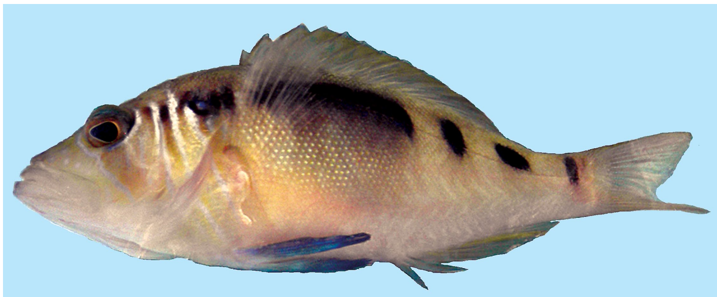
Figure 1. Hypoplectrus liberte , fresh holotype, UF 239538, 84.1 mm SL, Fort-Liberté Bay, Haiti (K.W. Marks).

Description. Dorsal-fin elements X,14 (X,14); anal-fin elements I,7 (I,7); pectoral-fin rays 14 (13–14), upper two and lower two unbranched, uppermost ray short, up to third of fin length, lowermost ray short, up to half fin length; pelvic-fin rays I,5, all rays branched; caudal fin with 15 (15) branched and 20 (21) segmented rays and 3 (2–3) visible dorsal procurrent rays and 2 (2–3) visible ventral procurrent rays; total gill rakers on first arch, including rudiments, 7 upper (6–7)+13 (13–15) lower=20 total (19–22).