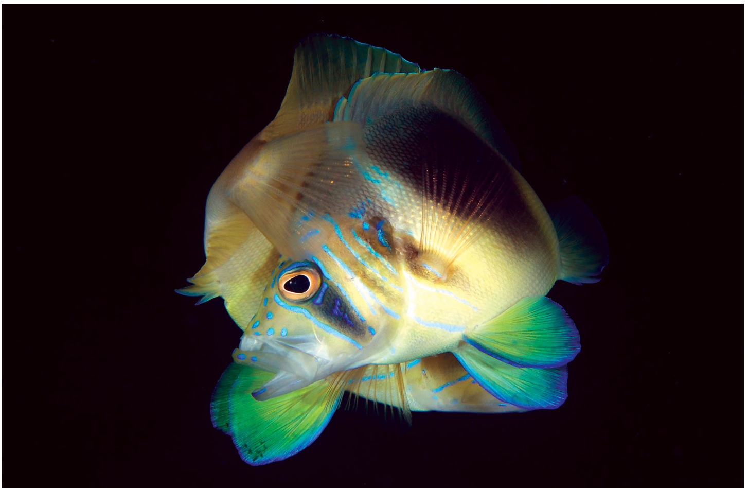
Figure 4. Mating pair in the Barred Hamlet, Hypoplecterus puella, in Dominica.