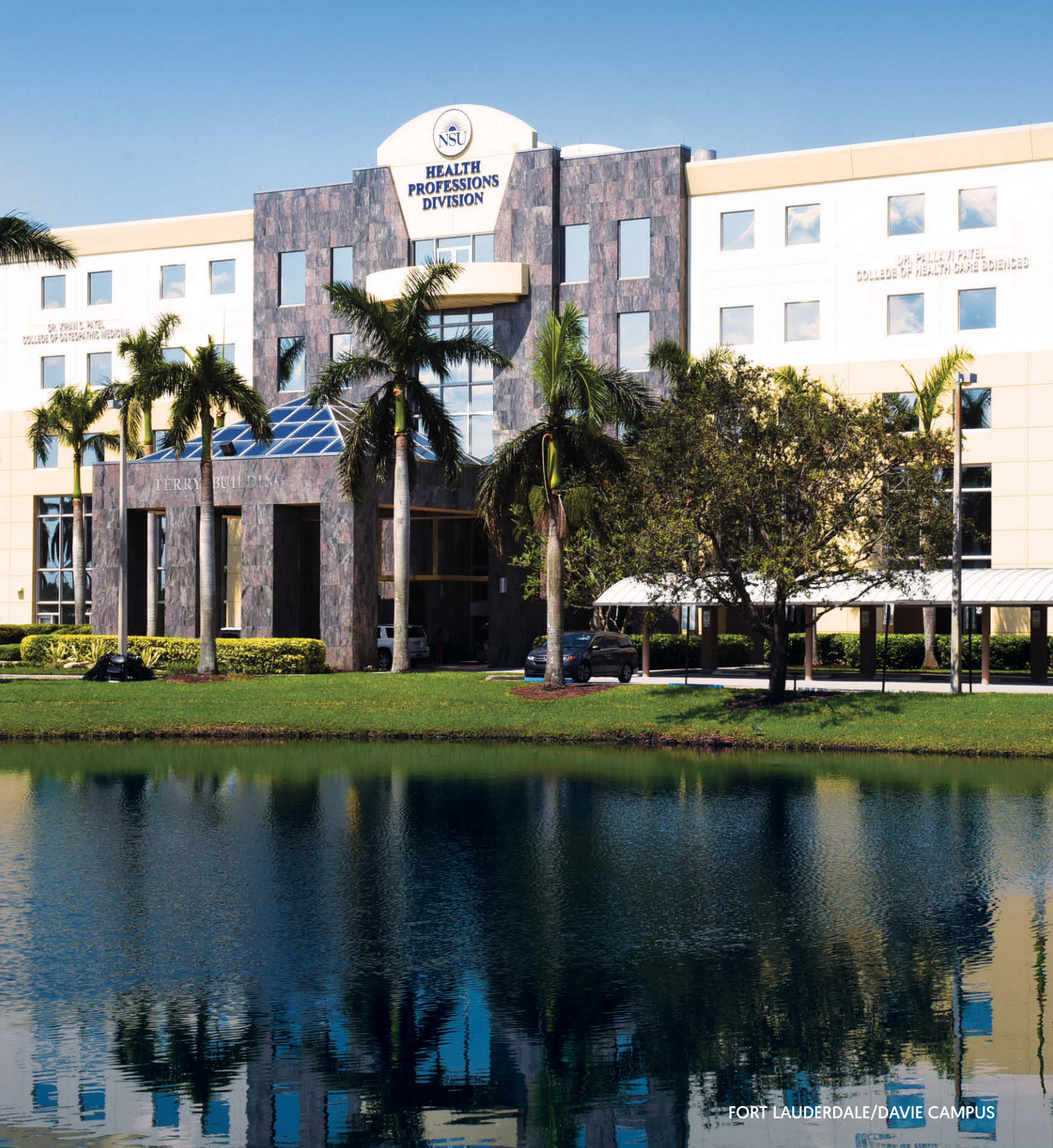
FORT LAUDERDALE/DAVIE CAMPUS

THE HEALTH PROFESSIONS DIVISION (HPD) , with a student body of nearly 8,000, is home to eight colleges. Located on the Fort Lauderdale/Davie Campus, it occupies a $70-million complex, covering 21 acres. It includes eight buildings totaling more than 900,000 square feet of space for classrooms, laboratories, offices, the Health Professions Division Library, an outpatient health center, and a pharmaceutical care center. Several of the HPD programs are also located at our regional campuses in Fort Myers, Jacksonville, Miami, Miramar, Orlando, Palm Beach, and Tampa, Florida, as well as in San Juan, Puerto Rico. These campuses extend our programs and resources to various communities. They offer you the ability to complete a degree at a location that may be more convenient to your home.