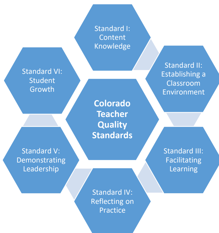
Figure 1. The framework of teacher quality. Adapted from the Colorado Teacher Quality Standards by the Colorado Department of Education (2011). Please see https://www.cde.state.co.us/educatoreffectiveness/teacherqualitystandardsreferenceguide for more information.

teachers for our diverse public schools. My training and experience as a supervisor of student teachers prepared me to observe and identify evidence of quality teaching in the interviews and observations for this case study. In addition, I have used the Colorado Teacher Quality Standards in my instruction and observations as a supervisor and instructor in a teacher preparation program. I was familiar with the first-year teachers in this case study due to my role as an instructor and supervisor in the teacher preparation program; however, I had no supervisory role during their first-year of teaching. My experiences of being a teacher in an elementary school made the setting a familiar one, and my experiences observing student teachers was helpful as I collected and analyzed data; however, I approached the study from the researcher perspective and designed the study to purposely address issues of trustworthiness.