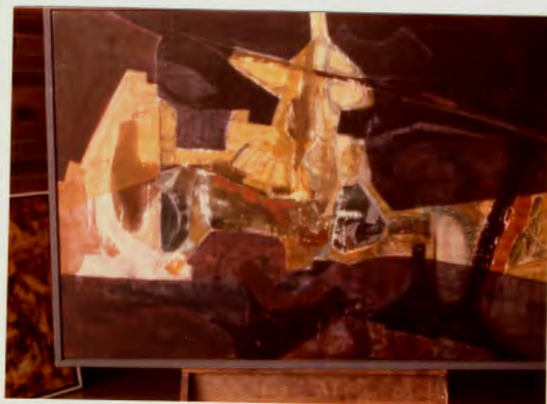
Figure 2. Charger 48" x 34"