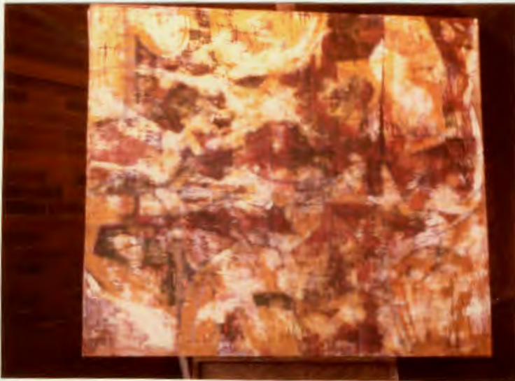
Figure 12. Three Depths To Follow 52" x 46"