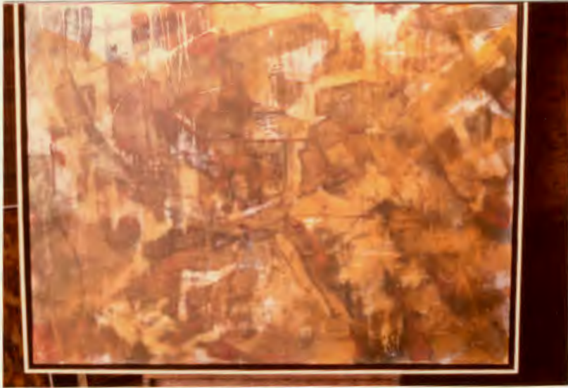
Figure 11. Surface of Mars: An Aerial View 48" x 36"