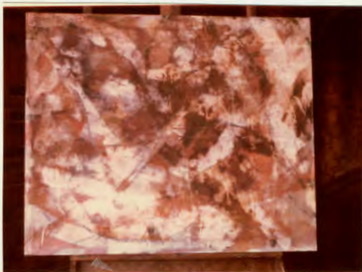
Figure 5. From Deep In The Rock 36" x 30"