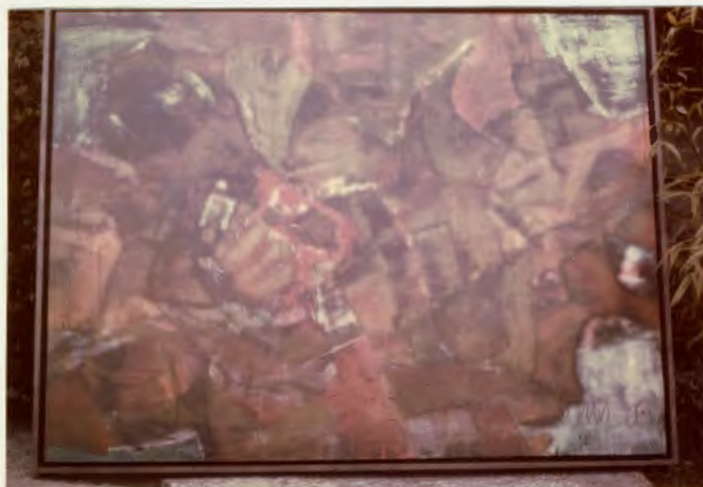
Figure 4. Den of The Fire Breather 48" x 47"