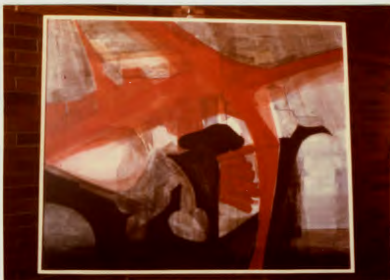
Figure 1. Jungle Lava and Rock 46" x 56"