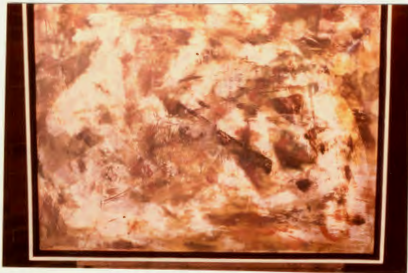
Figure 10. Oriental Landscape 33" x 24"