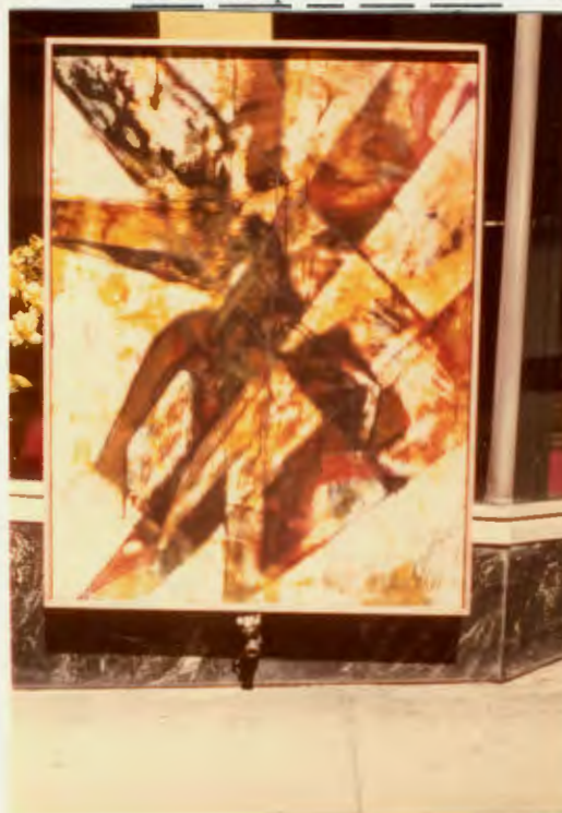
Figure 6. In the Eyes of Our Gods 32" x 40"