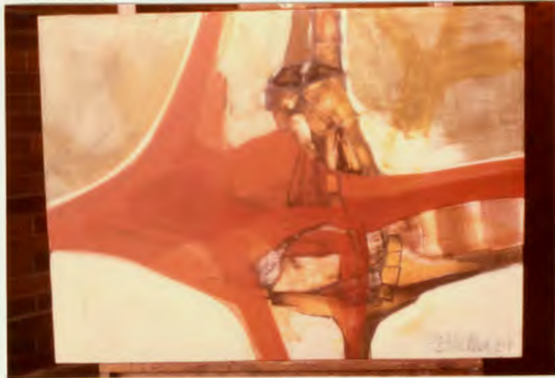
Figure 9. Ride A Rocket 32" x 24"