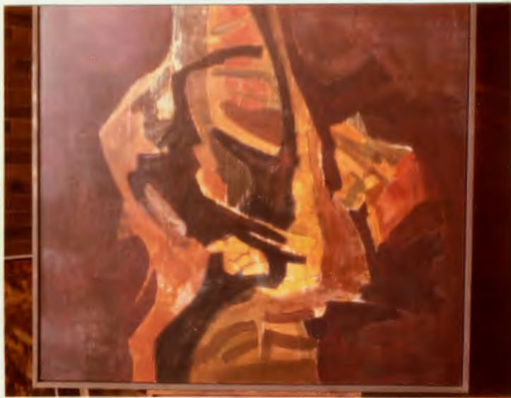
Figure 3. Internal Workings 52" x 48"