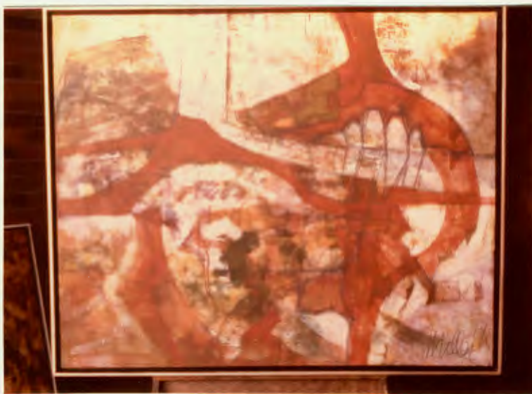
Figure 7. Greece and Back Again 48 1/2 x 39"