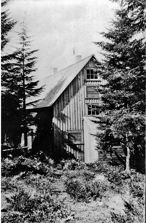
Meany Ski Hut