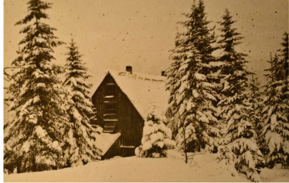
Meany Ski Hut