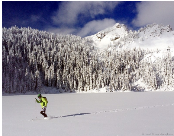
Brandon Kern breaking trail across Mirror Lake in 2014 Patrol Race.