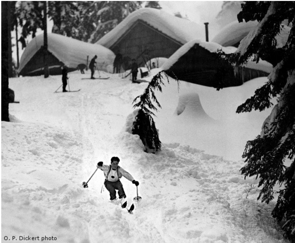
Mountaineers' Snoqualmie Lodge, ca 1930s.