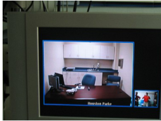
Figure 2. Telepsychiatry Equipment Example. Interactive TV and camera (left) and screen shot of remote psychiatrist office (right) – Jefferson County Hospital, Waurika, Oklahoma