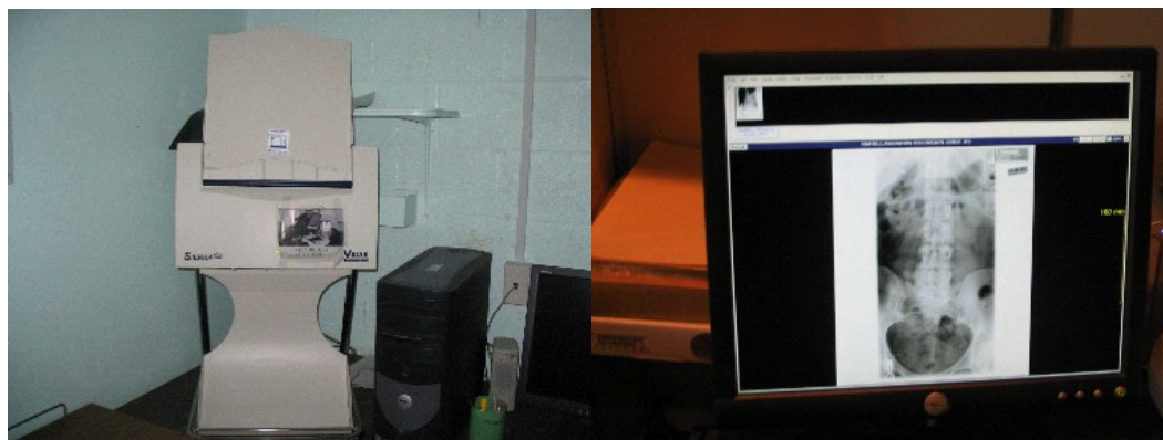
Figure 1. Teleradiology Equipment Example.

Telemedicine can deliver many different types of services. These include (but are not limited to): radiology, psychiatry, dermatology, home health, pathology, internal medicine, cardiology, pediatrics, obstetrics and gynecology, oncology and neurology. Two of the most common applications of telemedicine in rural areas are teleradiology and telepsychiatry.