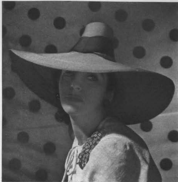
Green straw and blue grosgrain for a large hat. Lilly Daché; Ransohoffs, San Francisco