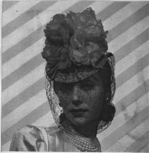
Straight pink flower clusters pile high on the crown of this burnt straw hat. John-Frederics