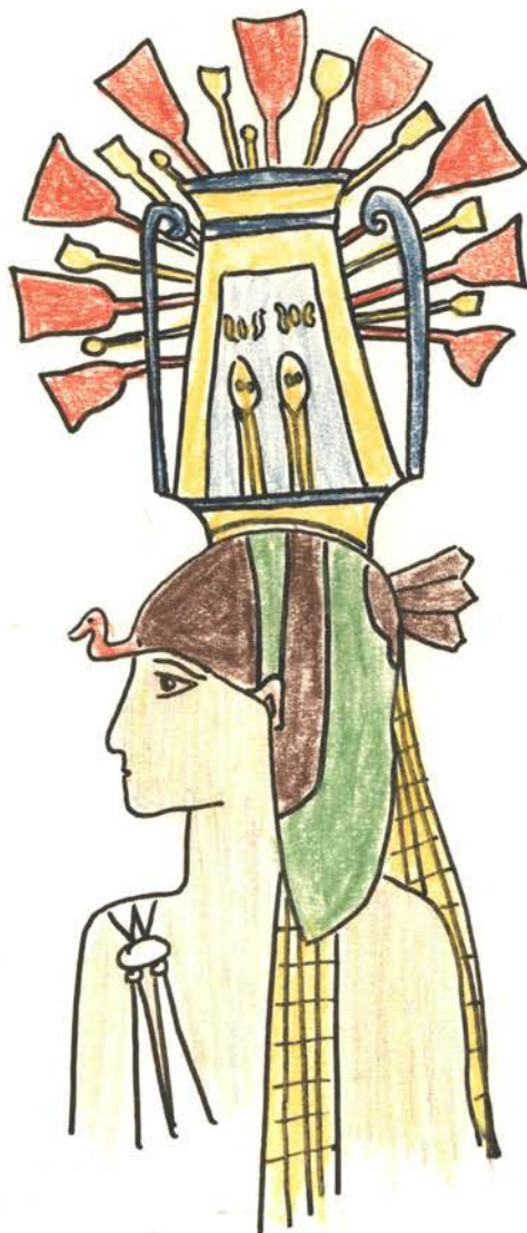
Egyptian Fig. 1

Top of Egyptian princess's head-dress. Sort of halo of flowers which seem to be open and closed lotuses in gold; the main piece seems to reproduce the entrance to an Egyptian temple.