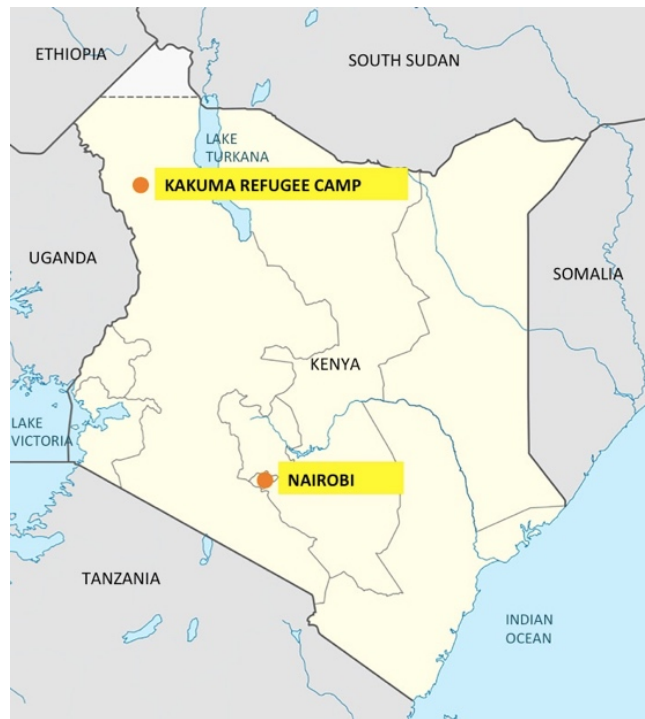
Figure 1: Kakuma Refugee Camp location in Kenya (Muñoz, 2017)

are Kenyan go through formal education through either Kenyan government training schools or colleges to become certified teachers. Less than 50 percent of school teachers, however, hold relevant teaching qualifications (The Lutheran World Foundation, 2015). The same interviewee stated that teachers who are refugees living inside the camp participate in “capacity building and trainings for those teachers who are from other countries” both within the refugee camp and occasionally at institutions and universities outside of the refugee camp in Kenya that are similar to the education designed for Kenyan teachers.