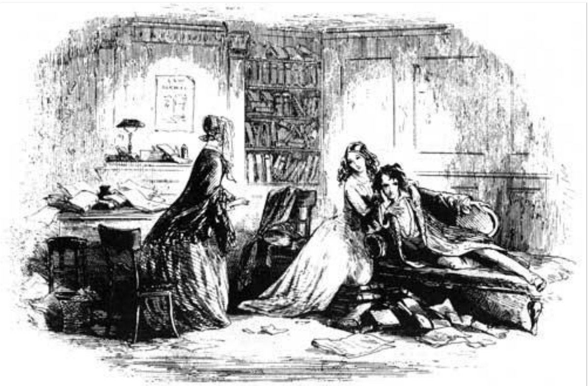
Fig. 3 Light

relates the news to John Jarndyce, the latter “[catches] the light upon [Esther’s] face” and observes, “You have been crying” (790). The image of light thus serves as a foil to emphasize the darkness that forebodes the characters’ troubles.