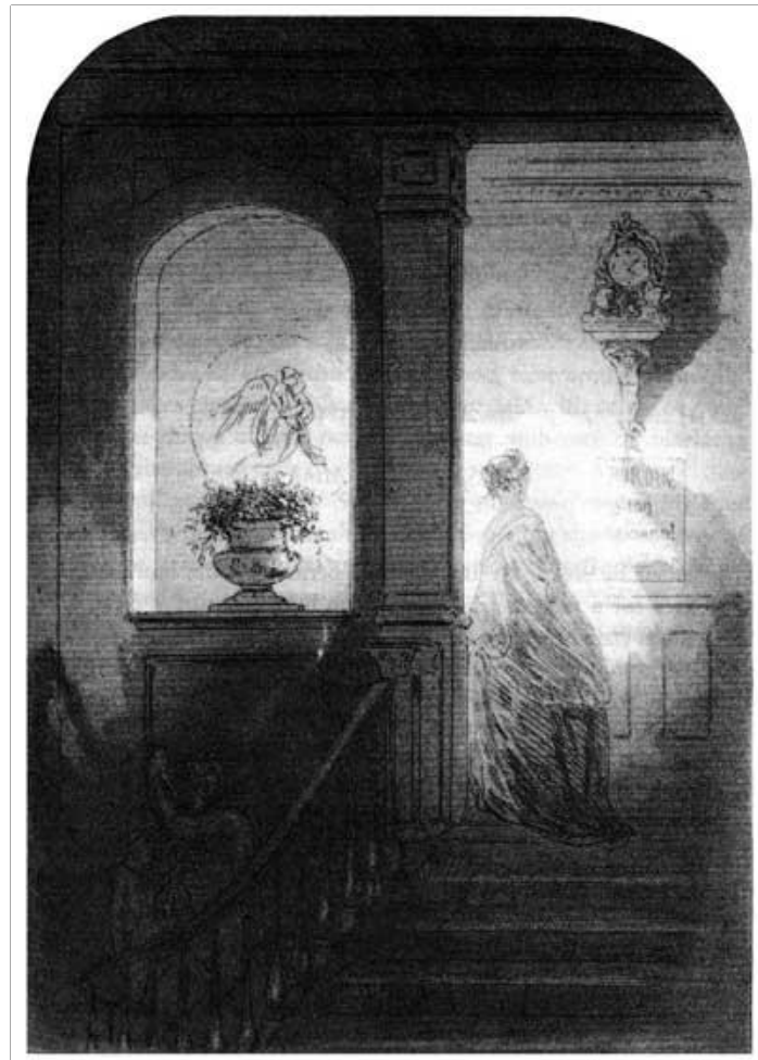
Fig. 4 Shadow

That the subsequent illustration (see fig. 4) is captioned "Shadow" (815) suggests that Dickens may have intended to juxtapose the two illustrations in this installment. Both illustrations portray a woman whose back is turned towards viewers. Although Esther's face is not visible in the first illustration, the illustrator has nevertheless rendered a clear outline of her figure. On the contrary, the second illustration presents a rear view of Lady Dedlock's indistinct figure as she