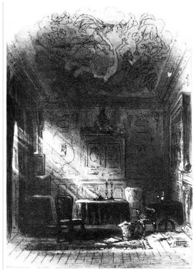
Fig. 2 A new meaning in the Roman

(751), this illustration (see fig. 2) depicts Mr Tulkinghorn's room with the Roman figure on the ceiling along with everything at which he points. The illustration in this chapter complements Dickens's narrative technique through the discreet manner in which it portrays the crime scene while enhancing his textual narrative by similarly drawing readers' attention to the Roman figure. Although much of the room is shrouded in shadows, the Roman with his pointing finger is clearly visible because the illustration portrays the figure in a lighter shade on the ceiling of the room. This image of the Roman thus becomes the center of attention in the illustration. Yet through his outstretched forefinger, the Roman diverts the attention that he has garnered to the spot at which he is pointing—the spot where Mr Tulkinghorn's body would have lain but is nevertheless missing from the picture. The stream of light pouring in from the opposite window likewise highlights the same empty spot by illuminating it. Like a spotlight, this eerie stream of light