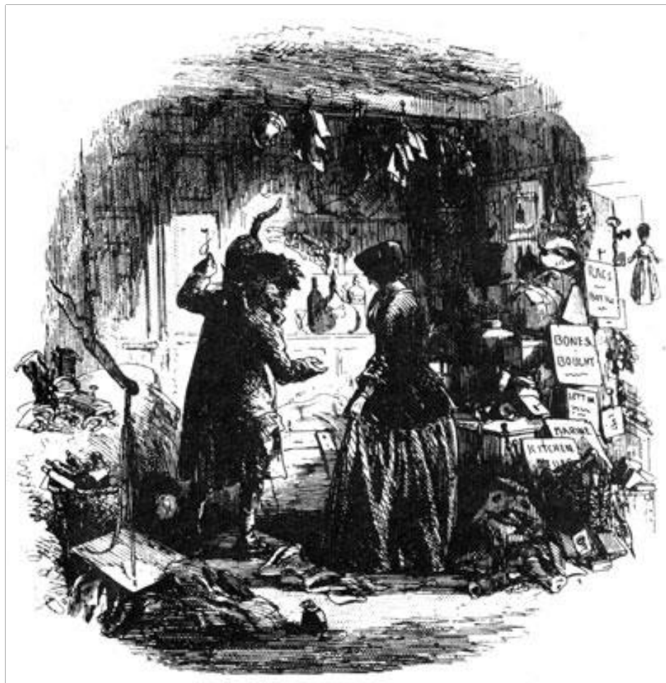
Fig. 1 The Lord Chancellor copies from memory

illustration, Michael Steig notes his use of dark plates that is very prominent in Bleak House . As though to complement Dickens's textual description of the fog and mud and dreariness that plague Chesney Wold and also much of the novel, Phiz's use of the dark plates substantiates the same mood: "allow[ing] for much more subtle uses of light and shades of dark . . . [the dark plate] contributes greatly to the dark and pessimistic atmosphere of the text, and among other things enables Browne to suggest the insignificance and helplessness of individuals in an institutional world, with an effectiveness scarcely possible by any other method" (Steig 15). The contrast of light and darkness becomes a dominant element in the illustrations that accompany the novel.