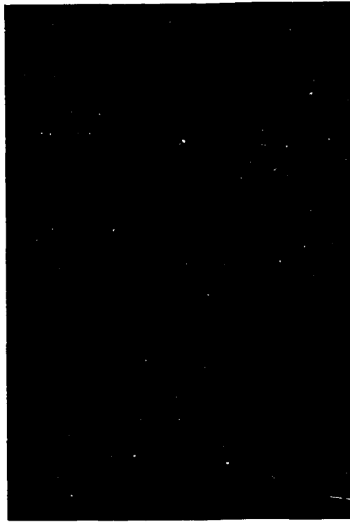
Student Product No. 3, Bound Buttonhole