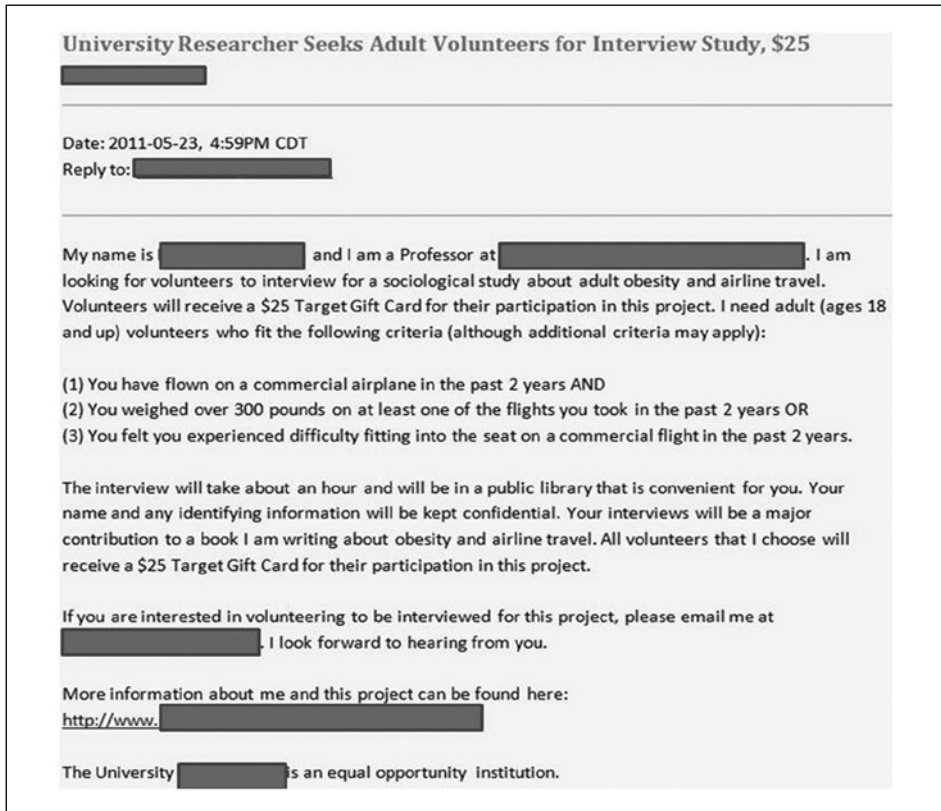
Figure 2. Craigslist screenshot of posting.

On 11 November 2011, a statement was added to the top to all postings to respond to flagging. This statement was 'PLEASE DO NOT FLAG THIS POSTING! THIS IS A LEGITIMATE RESEARCH OPPORTUNITY WITH THE UNIVERSITY <XXX>. FEEL FREE TO EMAIL ME (<XXX>) IF YOU HAVE QUESTIONS ABOUT THE LEGITIMACY OF THIS RESEARCH PROJECT'.