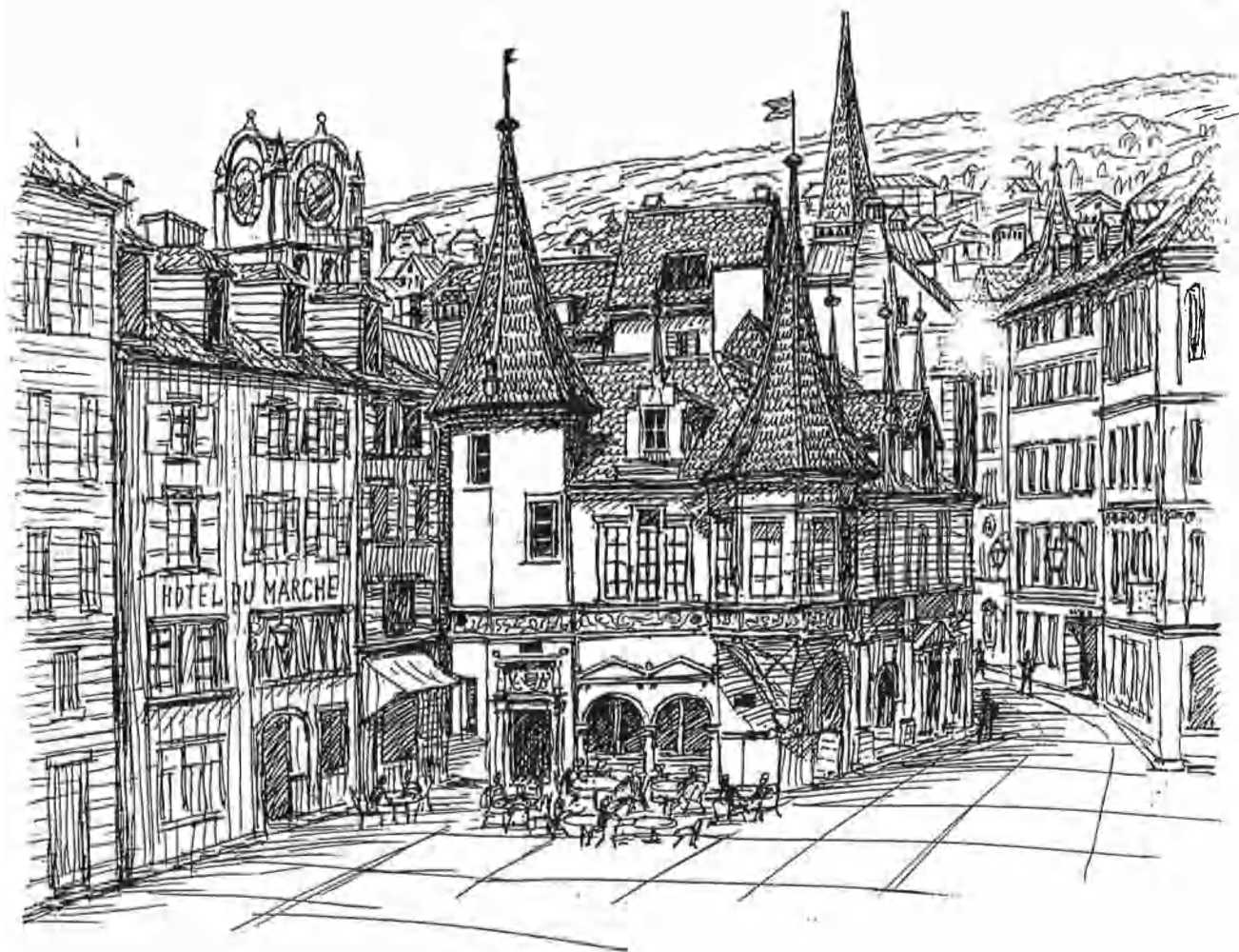
В торговом центре г. Невшатель. 11.9.98.