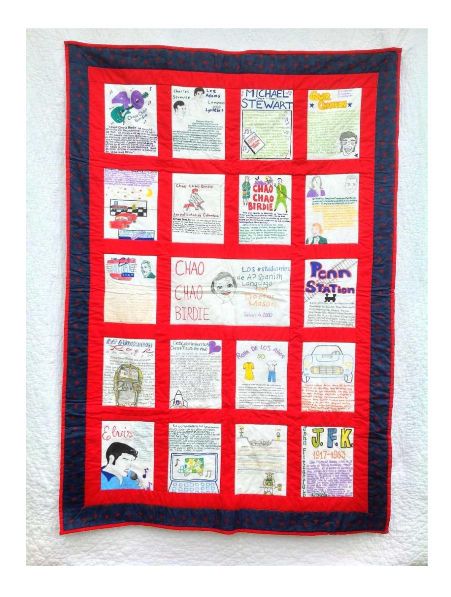
Interdisciplinary quilt tied to a school production of Bye Bye Birdie