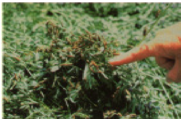
Figure 2. Black, spotted, striped, and gray blister beetles are representative of the many species in the U.S.

Emergence of adult blister beetles typically occurs after