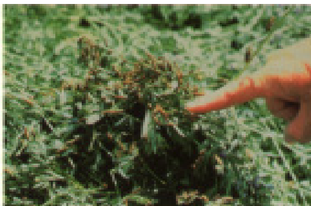
Figure 3. Typical swarm of striped blister beetles found on alfalfa hay.