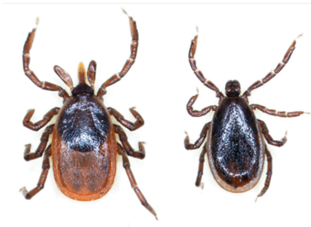
Figure 3: Deer tick or Black-legged tick ( Ixodes scapularis ) female (L) male (R).

The adults become active in late September and October and are present until March or April. During the early fall, it is often the most common tick on deer and cattle in Oklahoma. The larvae and nymphs are active in the spring and summer and feed on snakes and lizards. In Oklahoma, the black-legged tick is not known to transmit Lyme disease, because the larval ticks do not feed on mice that serve as reservoir hosts for the bacteria.