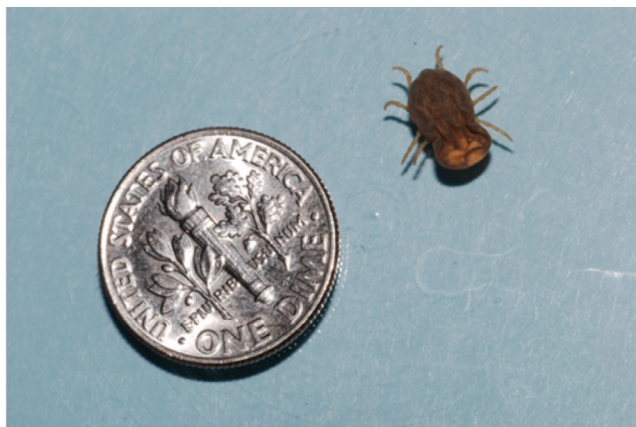
Figure 2: Spinose Ear Tick ( Otobius megnini ) nymph.

The spinose ear tick (Figure 2) is a common pest of cattle, horses and other domestic and wild hosts throughout Oklahoma. Humans have also been fed on by these ticks. The tick is found in the ear canals of its host. The presence of large numbers can cause severe irritation, inflammation and deafness of the animal. Secondary bacterial infections may cause sloughing of tissue into the ear canal. Infested cattle develop a “flop-eared” condition which causes discomfort in movement of the head.