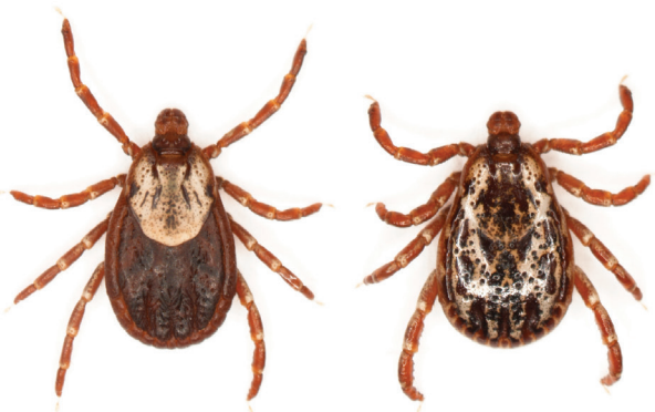
Figure 5: American Dog Tick ( Dermacentor variabilis) female (L) male (R).

The American dog tick is the only known vector of Rocky Mountain spotted fever (RMSF, Rickettsia rickettsii ) in