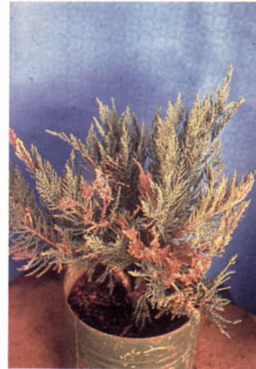
Figure 4. Juniper seedling infected with Phomopsis blight.

The disease is typified by the rapid death of the pine tree. If the wood is cut from these trees, the wood will be dry and no pitch flow will be noted. These symptoms should not be confused with the slow decline of pines that may result from drought conditions. Needles of drought stressed trees will turn brown and die, but the tree may put on new growth, and pitch will flow when the wood is cut. Several species of pines