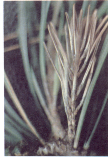
Figure 2. Stunted terminal branch of pine infected with Diplodia pinea .

Small black elliptical fruiting bodies of the fungus are produced on the needles. These structures break open in the late spring or early summer during periods of wet weather and release great numbers of spores. The spores can be spread by splashing rain or wind to infect other needles or trees.