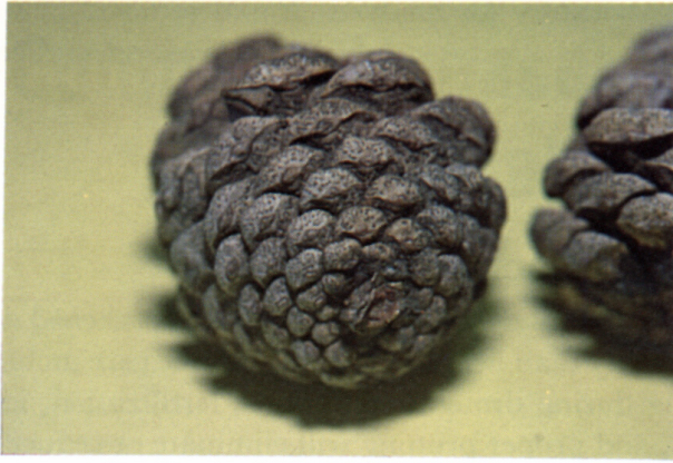
Figure 3. Pine cones infected with Diplodia pinea . The small black dots on the pine cone scales are fruiting bodies of this fungus.

usually have more severe disease problems because wetting of the foliage results in earlier spread of the conidia.