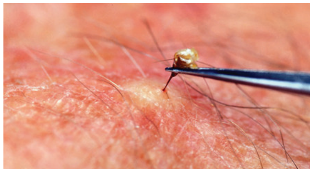
Figure 8. Honey bee sting.

What if you are stung? First, get away, run to the shelter of a car or building, and stay there even if some bees come in with you. Do not jump in water because bees, particularly AHB, will likely stay in the area until you surface up. Once safe, remove stings (Figure 8) from your skin. It does not matter how you remove them, as long as you remove them quickly to reduce the amount of venom injected.