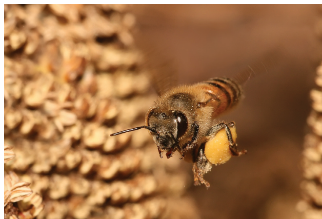
Figure 2. Worker honey bee carrying pollen.