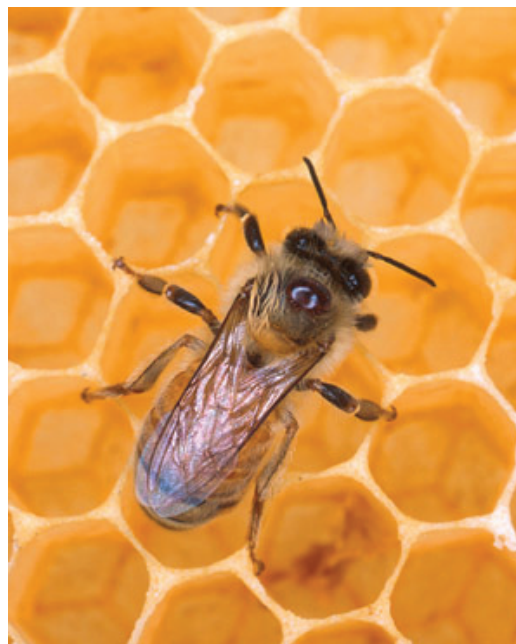
Figure 1. Honey bee queen depositing egg into comb.

Honey bees have a complex society with defined roles for each caste: the queen (Figure 1) mates with drones in a nuptial flight and lays several hundred eggs per day. Her body is considerably more elongated than that of drones or workers, especially during her egg-laying (oviposition) period. The queen cannot feed herself and needs help from the bees that take care of her. Her life span is one and a half to two years, after which a younger queen is produced within the same hive. The new queen takes over the colony and the old queen either dies, is killed, or is forced to leave. Worker honey bees (Figure 2) are also females. They will take care of brood (egg, larvae, and pupae) as young adults and forage for pollen and nectar later in life. Male honey bees or drones, do not collect pollen or nectar, are noticeably larger than workers, and their only known function is to mate with the queen. During late spring and summer, there is one queen, fifty to sixty thousand worker bees, and several hundred drones in a colony.