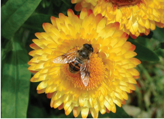
Figure 10. Syrphid fly

However, they have only two wings which are not held over the back of the body when at rest. Some species are hairy and have a long, thin abdomen. Antennae are short, not elbowed, and the distal segment bears a strong hair (seta). These flower flies are harmless as adults, but serve as aphid predators in the larval stage.