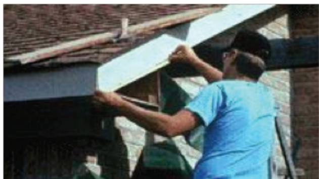
Figure 7. Bee proof the overhang in your home.

Look for cracks and holes that could be occupied by a colony. If appropriate measures are taken to screen or caulk holes, or fill cavities with insulation, honey bees will not be able to colonize. Overhangs and eaves in homes are places honey bees are likely to occupy and appropriate measures to cover them should be taken (Figure 7).