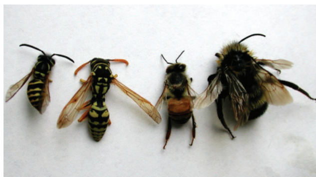
Figure 9. Yellowjacket, paper wasp, honey bee and bumble bee (left to right).

Honey bees are reddish brown with black bands encircling their abdomen. They have a subtle striped appearance, and short hairs all over their body – even on their eyes. They are smaller than bumble bees and have pollen baskets on their hind legs to carry food. In the hive, they do dances to tell other bees how far to fly for food. As mentioned earlier, they can sting only once.