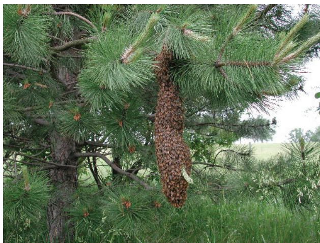
Figure 6. Honey bees swarming in a pine tree.