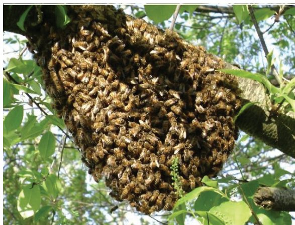
Figure 5. Honey bees swarming in a branch.