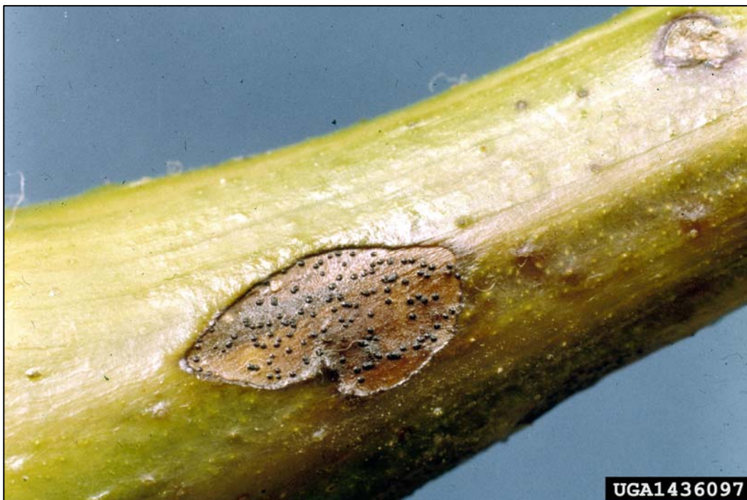
Figure 2. Petiole lesion symptoms of black rot, with fruiting bodies of the black rot fungus in the lesion middles (Photo provided by Clemson University, USDA Slide Collection; bugwood.org).