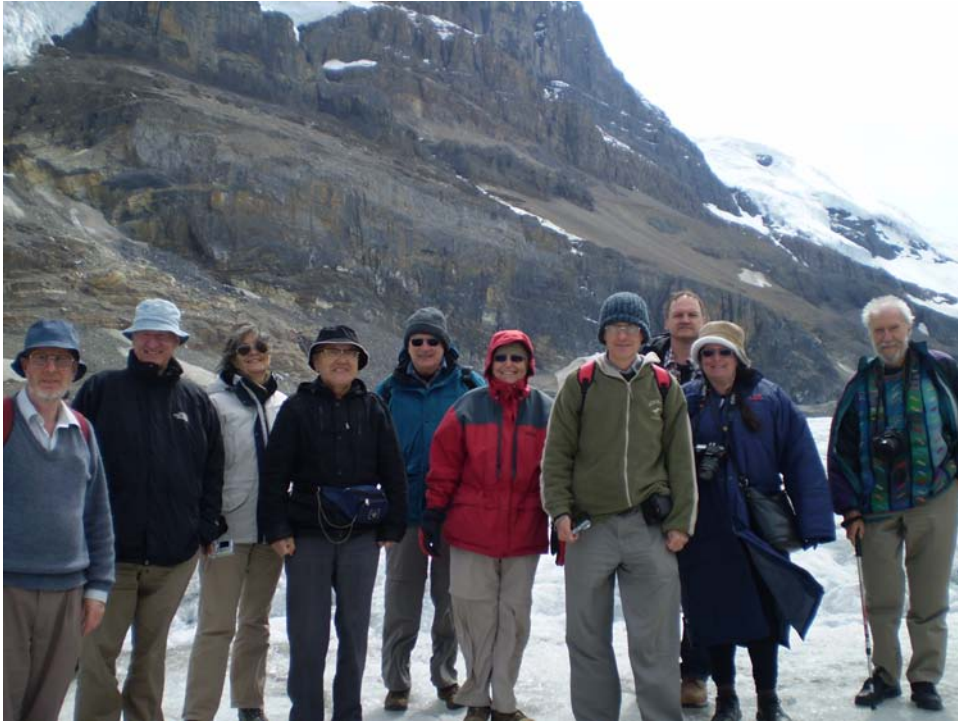
INHIGEO group visiting the Columbia Glacier

At Bow Summit a view over Peyto Lake and the linear Mistaya Valley graphically demonstrated the influence of thrusting and glacial erosion in the formation of the Rocky Mountains. After admiring several beautiful lakes, including Bow, Hector and finally Louise, the overnight stop was at the town of Lake Louise. In the evening the field trip dinner was in a restaurant tastefully converted from a genuine CPR station. To add to the ambience of the surroundings there were the passing rumbling lines of wagons as long trains made their way to and from Kicking Horse Pass.