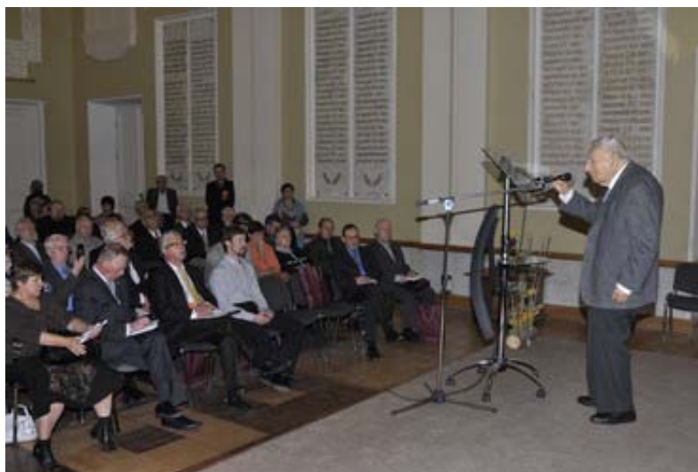
The late Victor E. Khain speaking at the International Conference 'Modern Geology: history, theory, practice' on the 250 th anniversary of the Vernadsky State Geological Museum held in Moscow, October 2009)