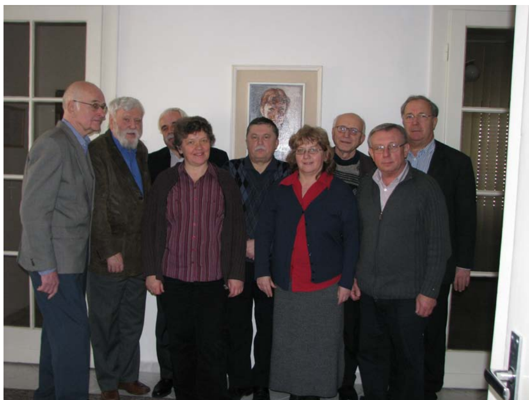
VISEGRAD Project members at their first official meeting in Bratislava, Slovakia