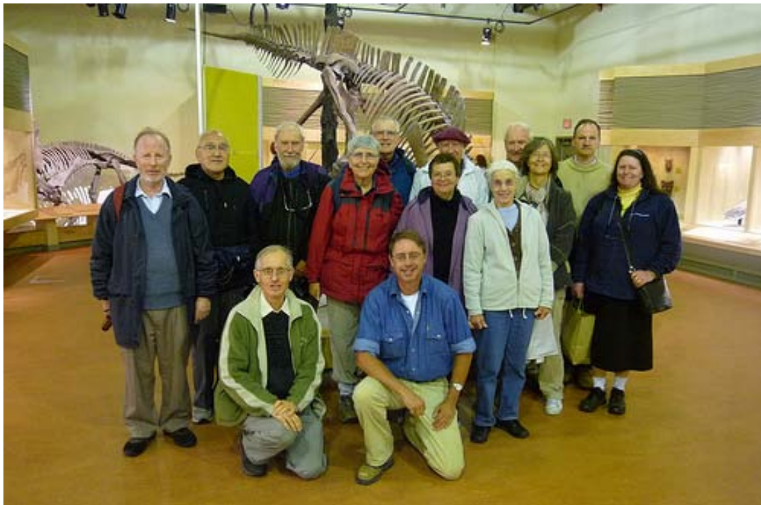
INHIGEO group at the Royal Tyrrell Museum