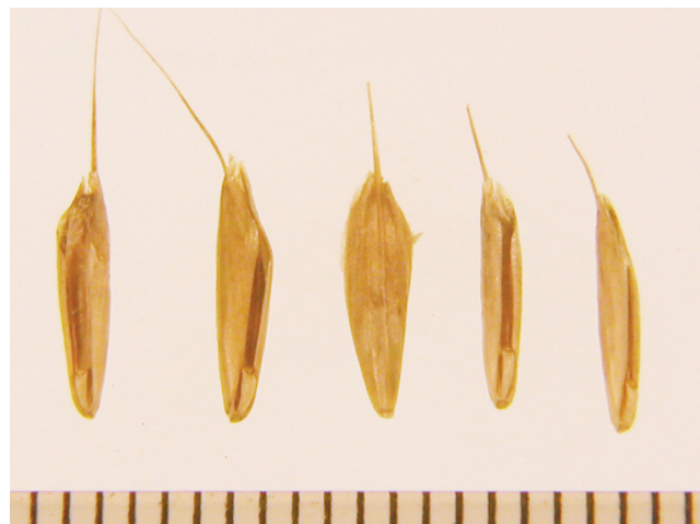
Figure 1. Cheat ( Bromus secalinus) is a very common weed in Oklahoma wheat fields. At maturity, cheat has short awns that distinguish it from downy brome.