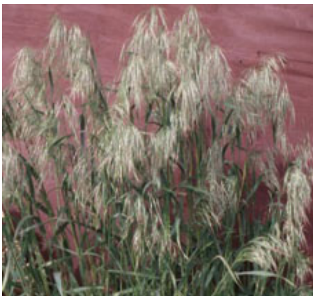
Figure 2. Downy brome ( Bromus tectorum ) seed have long distinct awns.