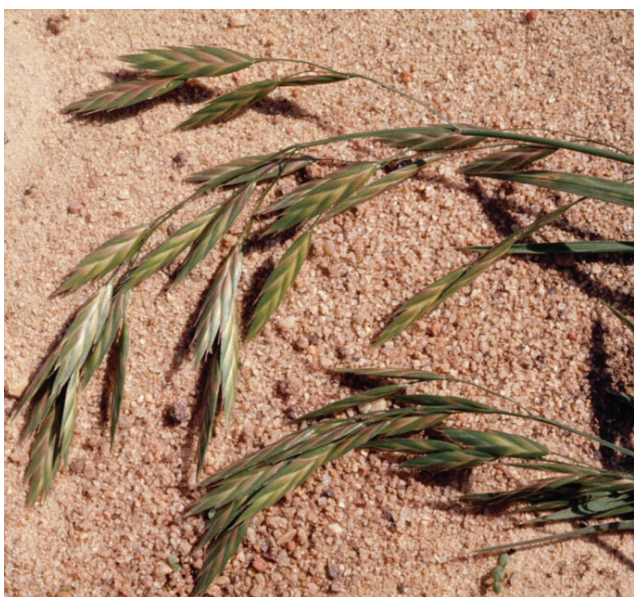
Figure 3. Rescuegrass ( Bromus catharticus ) seed are larger than cheat or downy brome and lack awns.