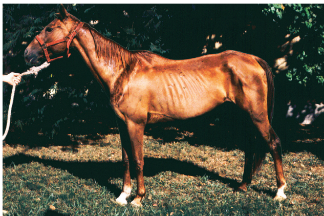
Picture 1. Horse in a body condition score 1. Note skeletal features evident in areas of normal fat deposition.