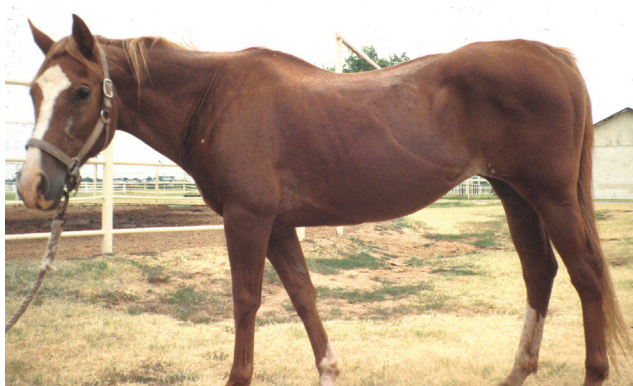
Picture 2. Horse in body condition score of 2. Note the evidence of individual vertebrae along the back and croup area.

can be placed into a horse's stomach so a liquid diet can be administered if a horse is unable or unwilling to eat. Placing a nasogastric tube into a horse's stomach should be performed by a veterinarian as an improperly placed tube can result in death. An intravenous catheter can supply nutritional support if a horse's digestive tract cannot handle liquid or solid food. This type of nutrition is costly and is only used short term until the digestive tract will accept and utilize feed.