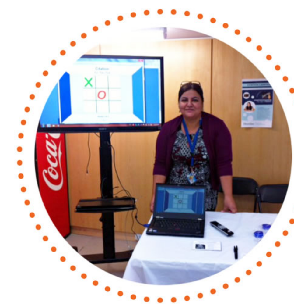
Citation Games Test your citation skills