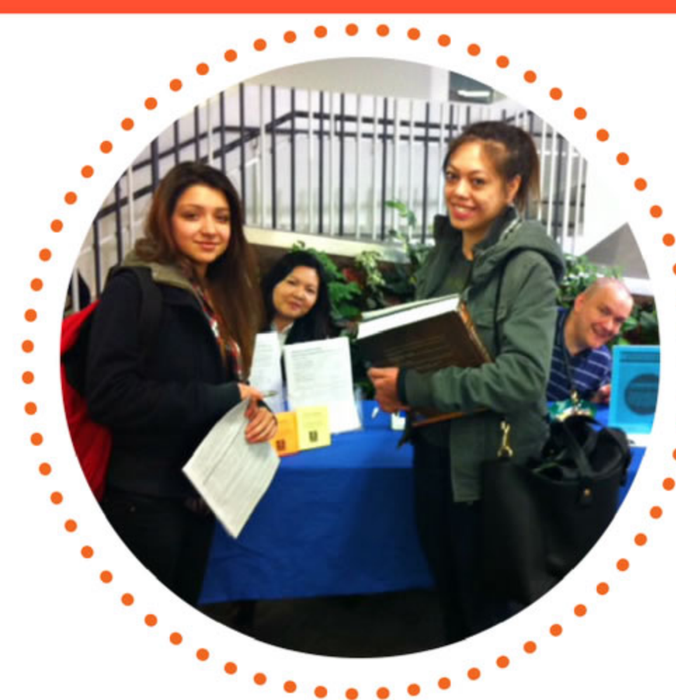
Citation Booths Find citation resources