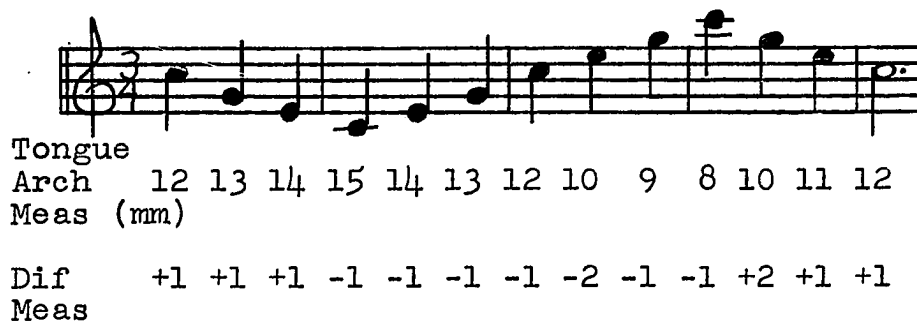
Fig. 4.--Tongue arch motion: example of anticipated pattern

The six ascending difference figures total -7 and the descending difference figures total +7. The averages are - 1.2 and + 1.2, respectively. The combined average for this example would be stated as +2.4, indicating that the total range for the combined motion is 2.4; the positive sign indicating the motion is in the anticipated direction. Figure 5 exhibits the measurements from a subject (No. 1) whose tongue arch is less consistent with the anticipated pattern. The six ascending figures total -8 with -1.3 as the average amount of change. The trend in the descending series is inconsistent, with five instances of an increased tongue arch and one appearance of a decrease in arch. To compensate for this inconsistency the decrease (-1) is added to the sum of the five increase figures (+7). The resultant +6 represents the adjusted total used for computing the average, which results in a figure of +1.0. Subject No. 1 changed the aperture between his tongue and palate an average of 1.3 millimeters