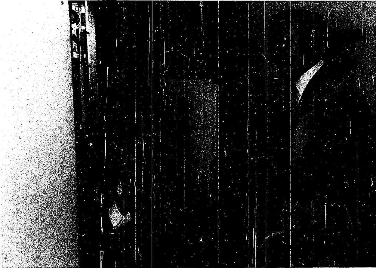
Fig. 2.--Subject positioned between roentgenographic machine and fluoroscopic table