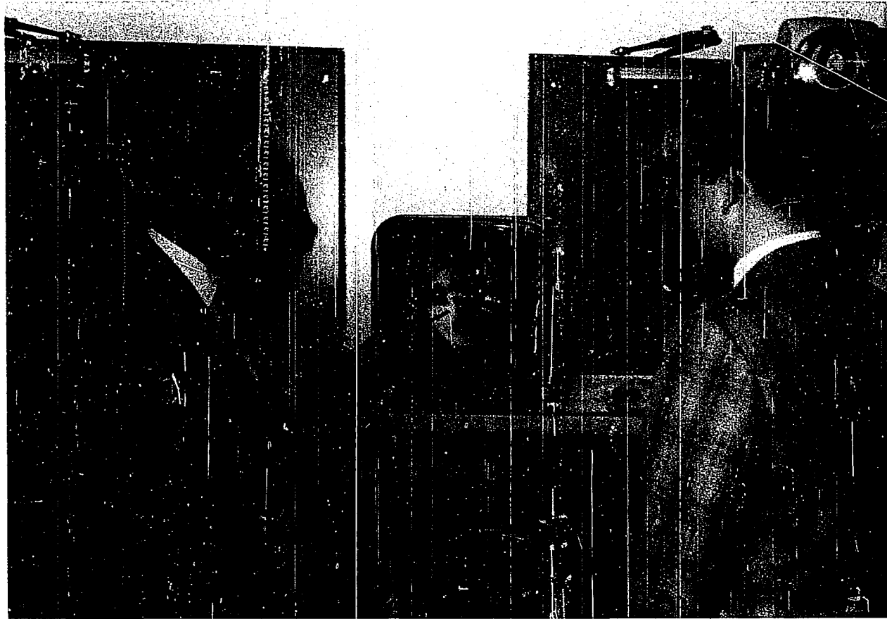
Fig. 3.--Image projected on monitor screen