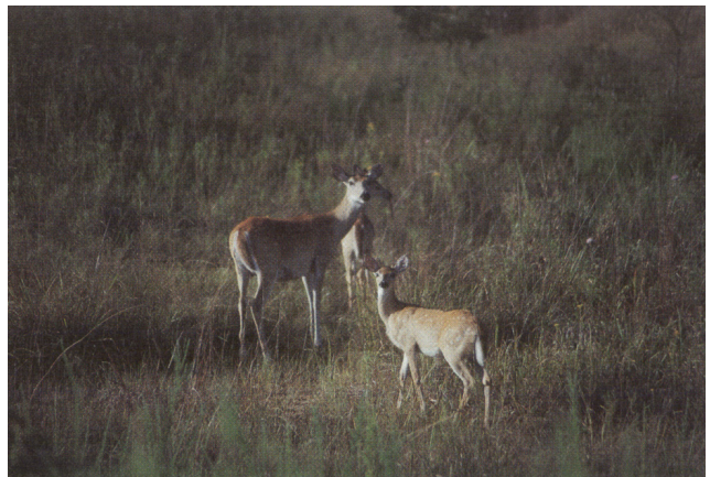
Figure 2. Twin fawns are commonly born to adult does when range conditions are favorable to provide adequate nutrition.

Most fawns are born in May and June in Oklahoma after a gestation period of 187 to 222 days. Gestation is prolonged when habitat quality is poor. Twins are commonly born to adult does when range conditions are favorable for providing adequate nutrition (Figure 2). However, in some years habitat quality, and thus diet quality, may be low because of low rainfall in the spring; then, single fawns are born. Rarely, triplets may be born when a mild winter is followed by abundant spring rainfall and suitable growing conditions for plants.