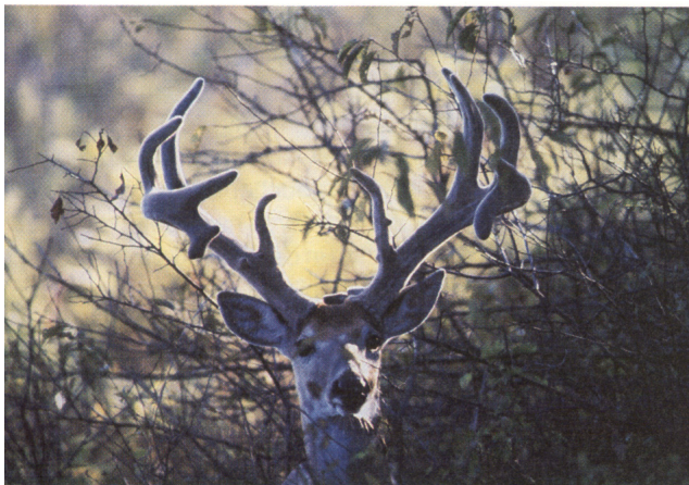
Figure 1. Deer shed their antlers every year. Developing antlers are covered with velvet until they begin hardening in late August.

Antler size and shape are determined by nutrition, age, and genetics. Age and nutrition are the primary influencing factors. Antler development is delayed when spring range condition is poor and diet is inadequate. This may be caused by a late spring or an early summer drought. Deer can recover