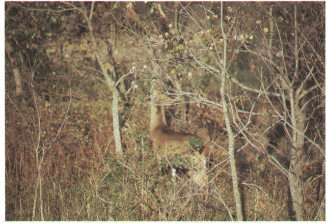
Figure 3. Persimmon fruits are a soft mast relished by deer.

Food habits and browse preference studies indicate that white-tailed deer may eat over 100 different plant species in a given locality. However, all vegetation that grows within a given home range is not potential food. Some plants are fair, others good, and a few provide excellent food. Both mule deer and white-tailed deer eat many kinds of plants, but the bulk of their diet in any one area may be made up of relatively few foods. Deer are primarily browsers, feeding on woody twig ends and leaves during most of the year, but will preferentially use forbs (weeds) spring and to a lesser extent in summer. Warm season grasses (such as native bluestems) are used only to