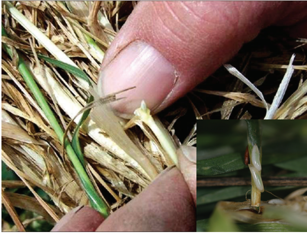
Figure 3. The second instar larvae of the Hessian fly can be found by splitting open stems in late winter. Note the whitish/green color of the larvae at this stage.