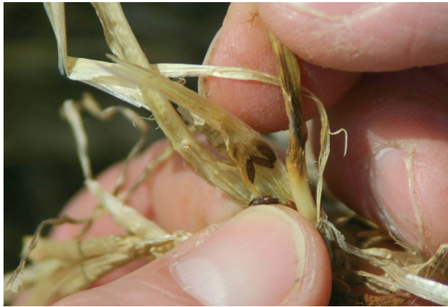
Figure 4. Full-grown Hessian fly larvae form rice-like puparia that are shiny and dark brown. The puparium is commonly referred to as a “flaxseed.”