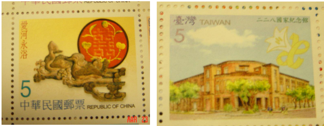
Figure 3. 2:28 Stamp Bears the Name “Taiwan” (Shown on the right.)

Other companies which bore the word “China” in their name have been going through or considering the name change process. On the same day as Chunghwa Post’s name change, China Petroleum Company, CPC (中国石油), formerly owned by the ROC Government, changed their to CPC, Taiwan (台灣中油) 16 This was so that people confuse the company with mainland. CPC’s original name the word chungguo (中國) in it, which by most people is interpreted to be mainland China. The new name still bares the character chung (中) in its name but that is because some other company already had the name Taiwan Oil (台灣石油). 17