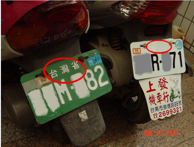
Figure 5. License Plate Name Removal

stopped producing plates with the words “ Taiwan shen. ” Instead the plates are being produced with no name at all only the license number, see figure five. 19 In doing so it may also gradually erase impressions that Taiwan is part of China.