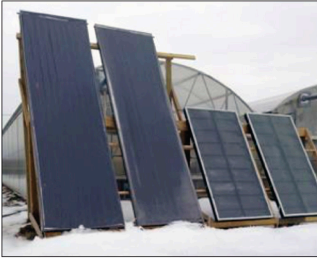
Figure 2. Thermal solar panels.