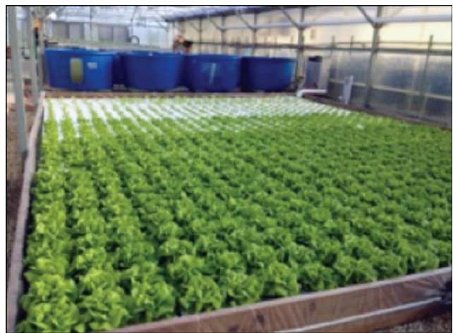
Figure 7. Deep-water culture.

for certain plants, or they can be made by making planting holes in closed-cell polystyrene insulation board (regular polystyrene will break apart). Hole spacing depends on the plant, but an 8-inch spacing will work for most leafy greens. Like NFT systems, seeds are started in media cubes or net pots filled with media.