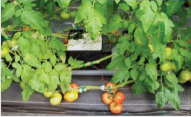
Figure 11. Dutch bucket tomato production.

products of fish. Nutrients are a function of the food fed to the fish. A general guideline for feeding is 2 to 4 ounces of fish food per 10 square feet of plant production area. (For more information on nutrient rates and ratios, see SRAC Publication No. 454, Recirculating Aquaculture Tank Production Systems: Aquaponics—Integrating Fish and Plant Culture .) Having too much of a certain nutrient (toxicity) is rare in an aquaponic system. However, even in a balanced system some nutrients such as iron, potassium, and calcium may be deficient and will have to be added to the system. They are generally added as chelated iron, potassium hydroxide and calcium hydroxide. The first is slowly released over time, and the latter two add minerals and raise pH. Symptoms of deficiencies include chlorosis, tip burn, blossom end rot and yellow leaves. The level of pH can affect the ability of a plant to take up certain nutrients. Most plants adapted for an aquaponic system have an optimum pH of 6.2 to 6.5; at levels below and above that, certain nutrients become less available to the plant.