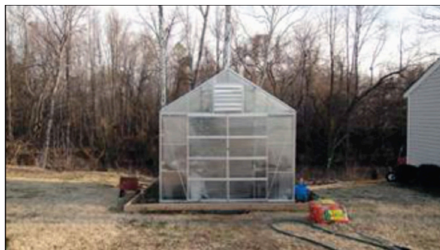
Figure 1. Hobby-scale greenhouse.

In a simple aquaponic system, nutrient-rich effluent from the fish tank flows through filters (for solids removal and bio-filtration), then into the plant production unit before returning to the fish tank. Solid fish wastes can be removed (depending on system design). Ammonia/ammonium in the water is converted to nitrite and then to nitrate by microbes living in the system. Microbes play a key role in the nitrification process in aqueous solutions. Plants remove nitrogenous waste from the water so it can be returned to the fish tank, and the nitrate and other minerals in turn feed the plants. Plants, fish, and microbes thrive in a balanced symbiotic relationship. All three organisms must be managed for a system to be successful.