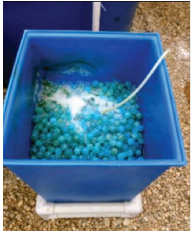
Figure 9. Biofilter tank.