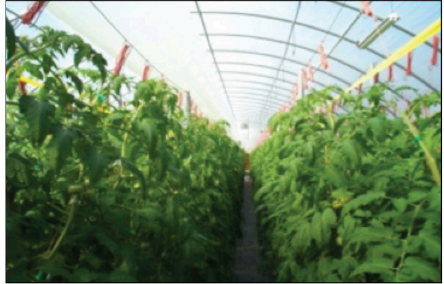
Figure 12. Use of yellow sticky tape to trap insects in tomato production.

Whether in an enclosed structure or outside, insect pests can be a problem. Typical pests found in aquaponics are aphids, whiteflies, spider mites, thrips, and caterpillars. Growers should use an integrated pest management approach (IPM) to controlling pests. This means combining mechanical, physical, biological, cultural, and chemical methods to keep pest populations in check. However, in aquaponic systems, most chemical control methods should not be used, as they