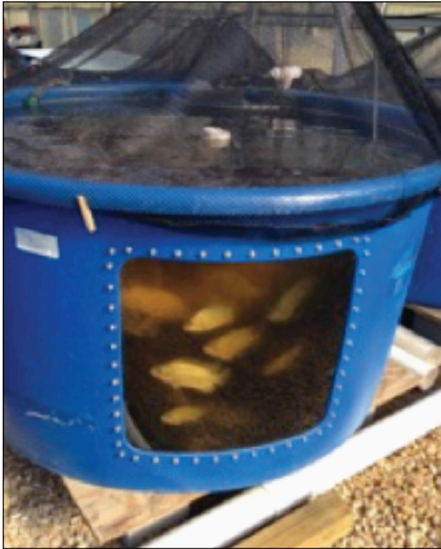
Figure 10. Tilapia production tank with netting.

in aquaponic systems and are arguably the most frequently used species in commercial aquaponic operations.