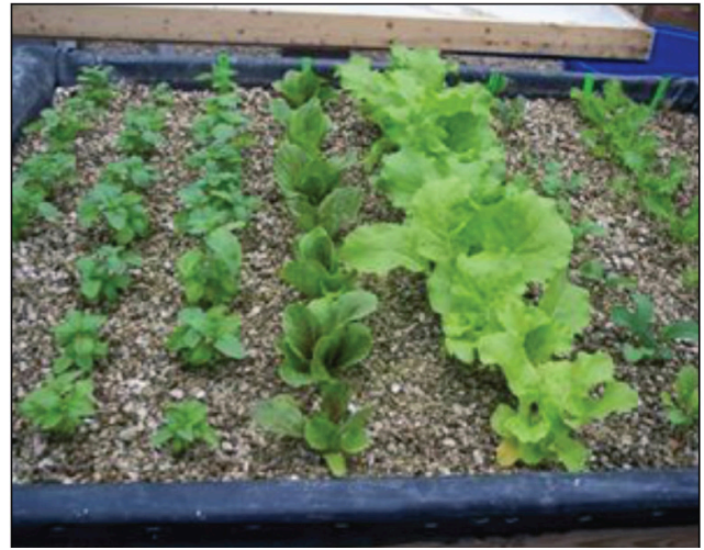
Figure 3. Media bed filled with vermiculite.

Media beds are easy and inexpensive to set up and can be a good choice for small-scale systems. A media bed system (Figure 3) is some type of container that holds media for plants to grow in. The media supports the roots of the plants and can act as a biofilter and solids filter. Types of containers used most often are 4-foot by 8-foot lined wooden beds, intermediate bulk containers (IBCs) and barrels. Beds either go through cycles of being flooded and drained or water flows through them continuously. Water should rise to only 1 inch from the top of the media to prevent excess algal growth, which encourages pests. Pumps, timers and/or a bell siphon can move water from the fish tank to the plant unit and then back to the fish tank. Media used in beds includes river rock (which has tested free of limestone), expanded clay pebbles,