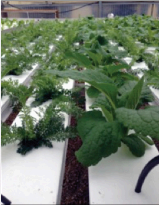
Figure 4. Commercially manufactured NFT production channels.