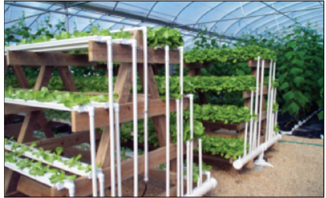
Figure 6. NFT channels arranged vertically to maximize production.

Float beds can be built on the ground of dimensional lumber and lined with plastic. They also can be built of concrete, cinder blocks or fiberglass. In the case of air lift and gravity flow systems, the beds may be elevated so the water can flow unaided by pumps through filter media or into a central sump. Polyethylene or fiberglass containers, such as IBCs and barrels, can be used as trays or troughs. The length and width of the beds are based on the dimensions of the float trays to make sure the bed is covered to prevent algal growth. Generally, a depth of 10 to 12 inches is adequate for plant root development, but beds as shallow as 6 inches will work in many instances. Rafts can be purchased specifically