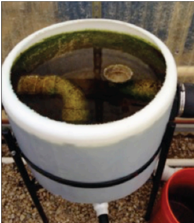
Figure 8. Swirl separator.

Since the microbes that colonize the media need to operate in an oxygenated environment, aeration is important. Dissolved oxygen levels in the biofilter tank should be maintained at more than 5 ppm. Stirring the media occasionally will maintain its efficiency by ensuring that water flow does not bypass active surface areas. See SRAC Publication Nos. 451, 452 and 4502 for more information on biofiltration in tank systems.