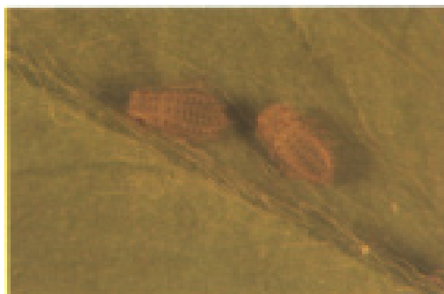
Figure 2. Spotted alfalfa aphid.

the importance of accurate species identification and timely control applications.