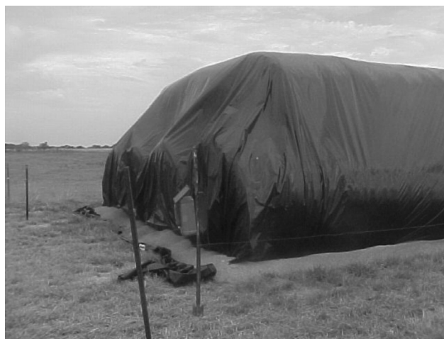
Figure 1. Black plastic sheeting (6 mils thick) covering hay.

Oklahoma Cooperative Extension Fact Sheets are also available on our website at: http://osufacts.okstate.edu