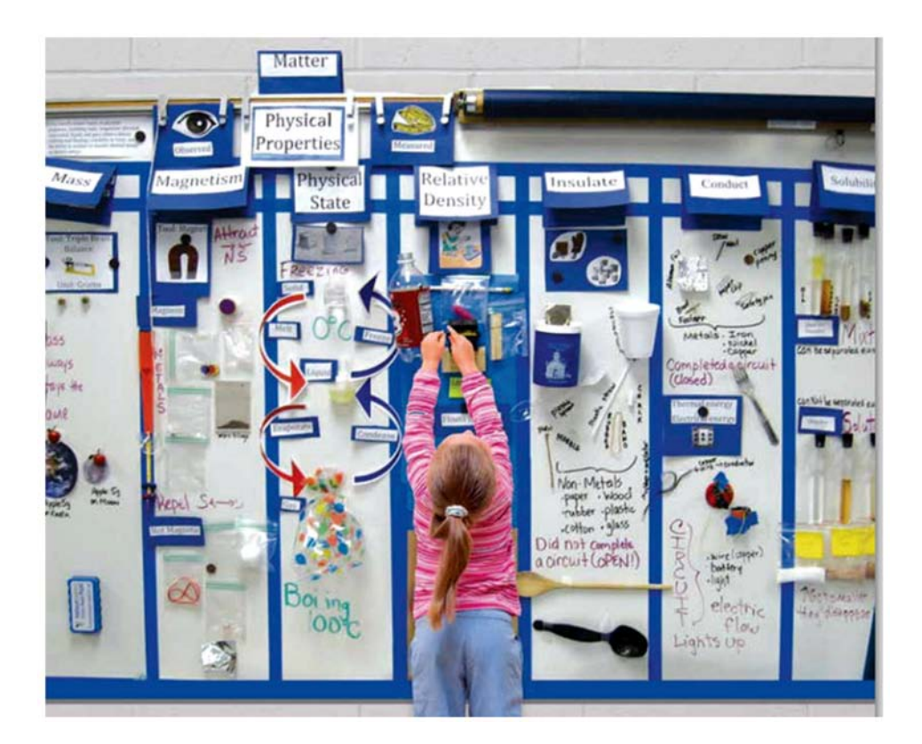
Fig. 3. Example of an interactive word wall from Jackson and Narvaez (2013)