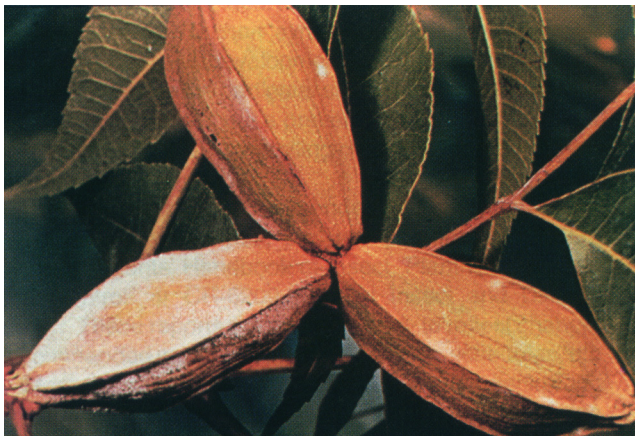
Fig. 4. Powdery mildew symptoms on infected nut shucks.