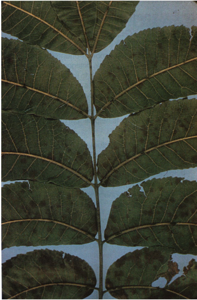
Fig. 3. Liver spot symptoms on an infected pecan leaflet.