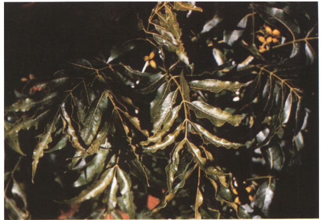
Fig. 5. Early symptoms of zinc deficiency (rosette) of pecan leaflets.