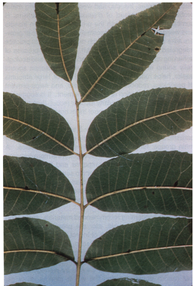
Fig. 2. Vein spot symptoms on an infected pecan leaflet.