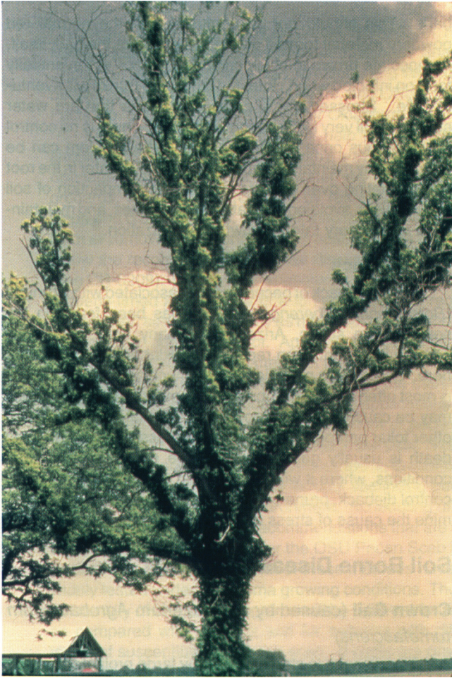
Fig. 7. Symptoms of bunch disease of pecan trees.

Scheduling of fungicide applications using the phenological method. There are two basic methods for deciding when to apply scab fungicides. The first, the phenological method, is based on the plant growth stages or phenology of pecans and is weighted heavily toward protecting the nut crop by preventing disease on nut shucks. The phenological method covers the critical periods of pecan crop development. It errs on the side of safety and may result in an application being made that is unnecessary. For natives and more resistant cultivars a maximum of three applications are applied. The initial application is made at the same time as the first pecan nut casebearer application, and for natives this means that the decision to apply fungicide can be made once it is certain that a good nut crop has set. A first cover application is made two to three weeks after that and is followed by a second cover application two to three weeks later. With this method a fourth application is needed for moderately to highly susceptible cultivars at the pre-pollination stage about five weeks after bud break.