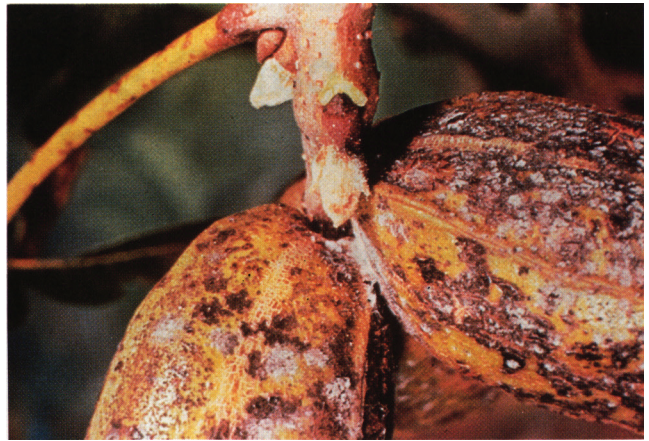
Fig. 1. Scab lesions on shuck of a pecan nut. The pink mold fungus is growing in some lesions.

With more effective, safer fungicides on the market and better information on scheduling fungicide applications, making decisions about using fungicides to control pecan scab does not have to be as difficult as it was in the past. We have an arsenal of fungicides that can be counted on to control scab when used correctly and wisely without sacrificing personal safety, food safety, or the environment. Scheduling of applications can be made using recommendations that are keyed to plant development stages or the OSU Pecan Scab Model available on the Internet. Both of these methods have been widely tested under Oklahoma growing conditions. The level of intensity of fungicide programs will be different for natives as compared with cultivars and for cultivars with different levels of susceptibility to pecan scab. If cattle are grazed in native groves, decisions will have to be made that are best for overall production and profit of that farm unit. Considering the low profit margin for native pecans, some growers may not be convinced that the cost of a fungicide program is a sound investment for natives. If scab fungicides are applied to natives when they are not needed or when there is not a nut crop to protect, the investment is certainly unsound. But it is an equally unsound decision not to apply fungicides to natives when they are needed.