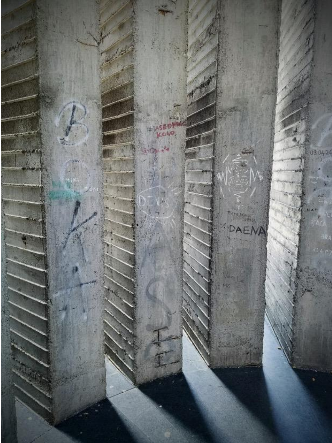
Figure 6. View from the interior space of the Monument to the Revolution . Kozara national park, Bosnia and Herzegovina. Designed by Dušan Džamonja and completed in 1972.