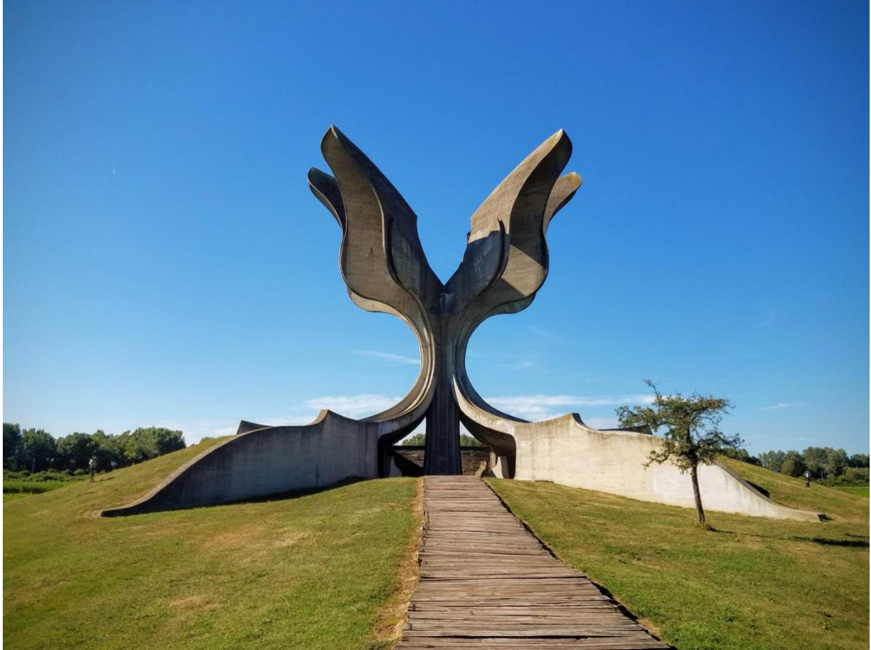
Figure 1. The Flower Monument, Jasenovac, Croatia

The “Stone Flower” monument, a 24-meter-tall concrete flower sculpture, is located on the site of the Jasenovac forced labor and extermination camp. The monument also contains a crypt at its base, housing the remains of those who died at the camp. Completed in 1966 and designed by Bogdan Bogdanović.