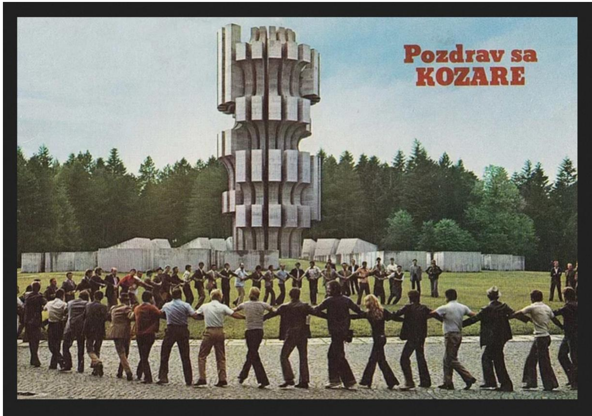
Figure 10. Commemorative ceremony at the Kozara Monument. https://www.spomenikdatabase.org/kozara