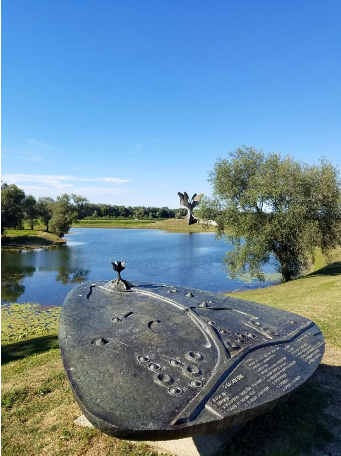
Figure 2. View of the “Stone Flower” monument with bronze site plan. Designed by Bogdan Bogdanović.