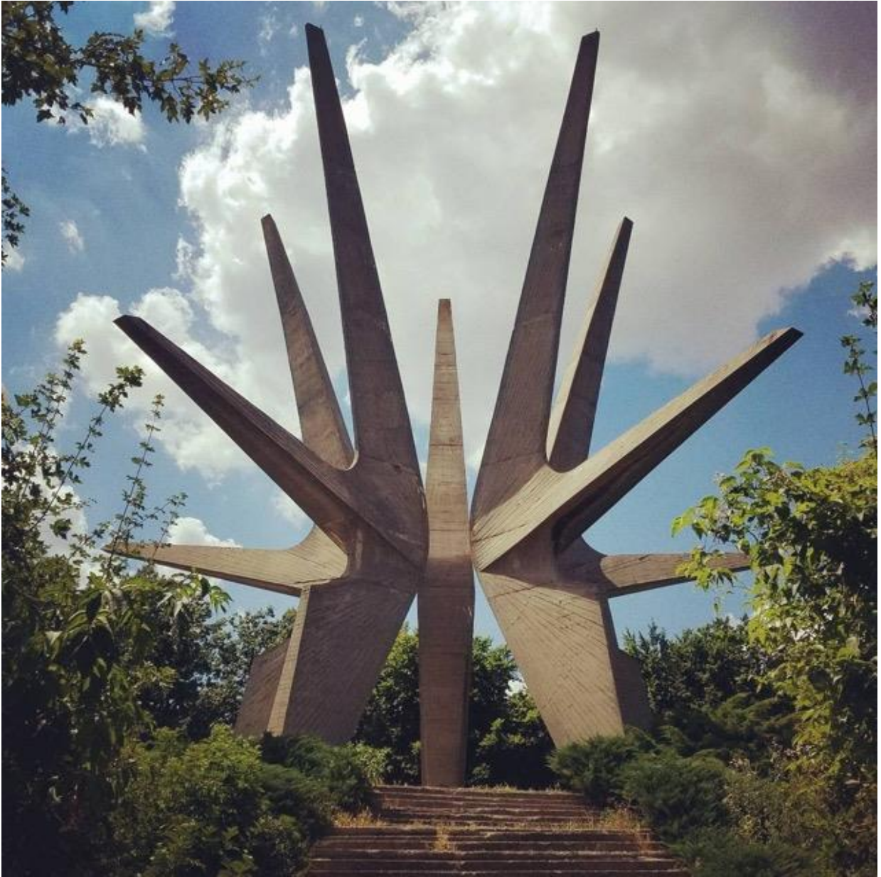
Figure 7. Monument to the Fallen Soldiers of the Kosmaj Detachment. Located in Kosmaj Mountain Park, Serbia (1 hour south of Belgrade). Designed by Vojin Stojić and Gradimir Medaković. Completed in 1972.