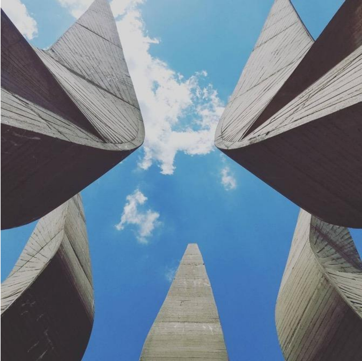
Figure 8. View from below of the “fins” of the “Kosmaj Monument.” Located in Kosmaj Mountain Park, Serbia. Designed by Vojin Stojić and Gradimir Medaković. Completed in 1972.