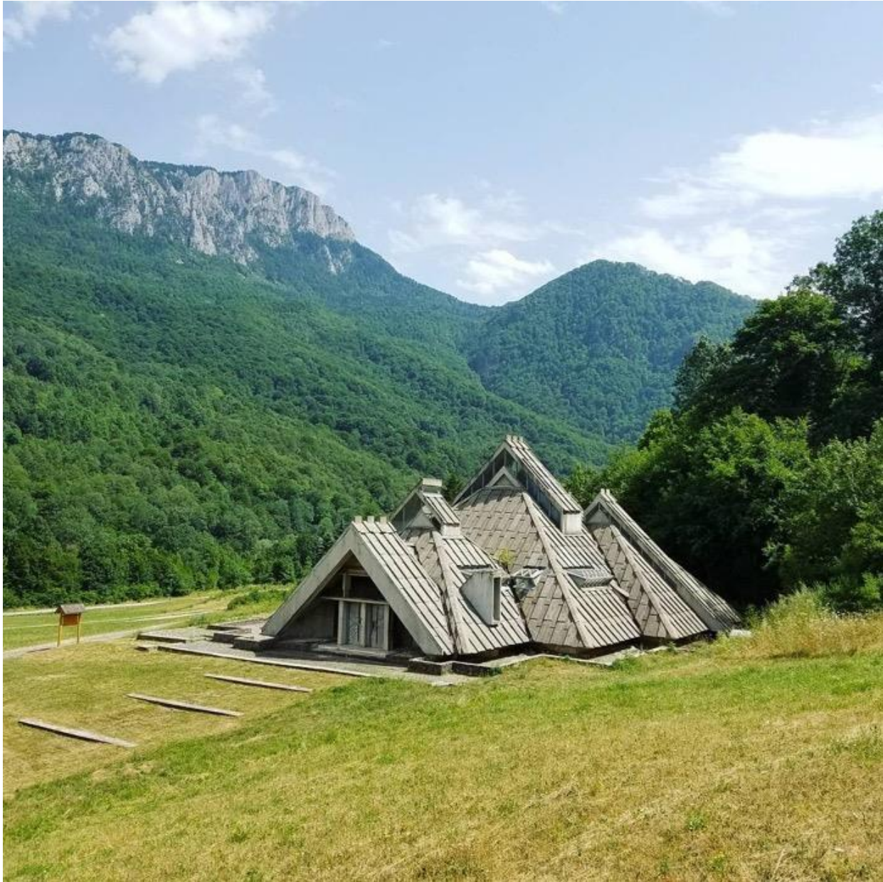
Figure 4. Sutjeska Memorial Center, Bosnia and Herzegovina Also part of the Tjentište Memorial Complex. Completed in 1971 and designed by Dorde Zlokovic.