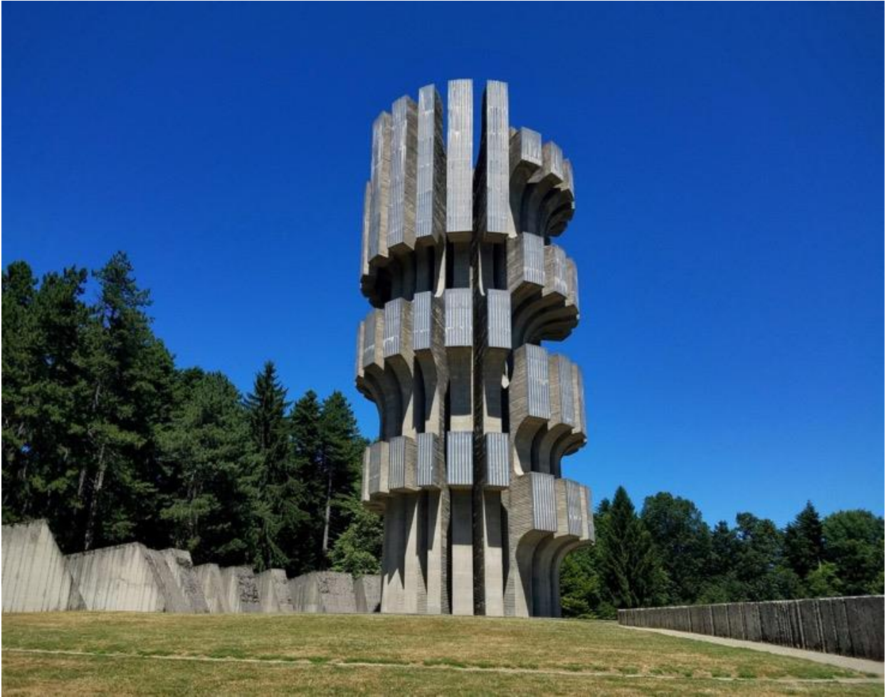
Figure 5. Monument to the Revolution , Bosnia and Herzegovina. Located in Kozara national park. Designed by Dušan Džamonja and completed in 1972.