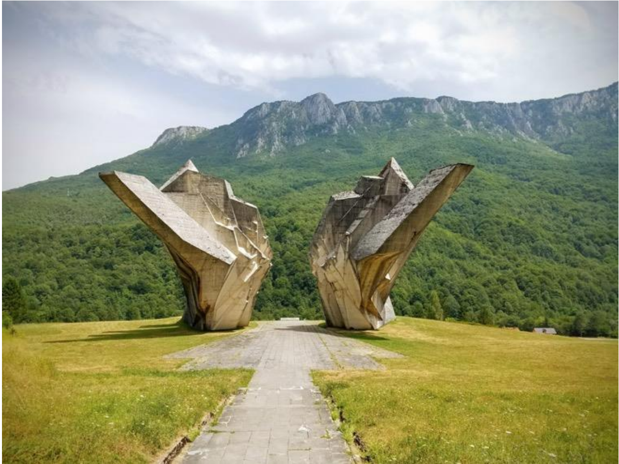
Figure 3. Battle of Sutjeska Memorial Monument , Bosnia and Herzegovina. Part of the Tjentište memorial complex, this monument also functions as a crypt, with the remains of the 3301 Partisan soldiers who died in the fighting at Sutjeska buried beneath. Completed in 1971 and designed by Miodrag Živkovi.