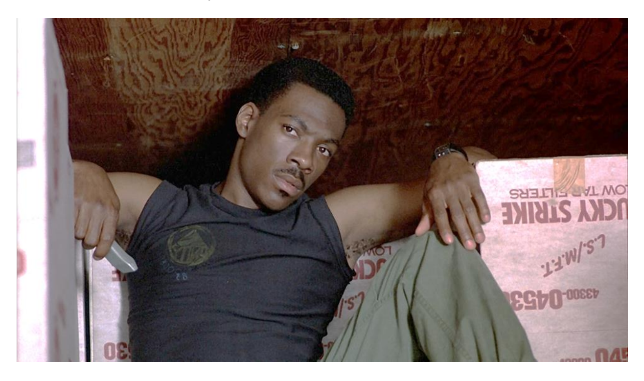
Figure 2. Axel Foley and the Cigarette Scam