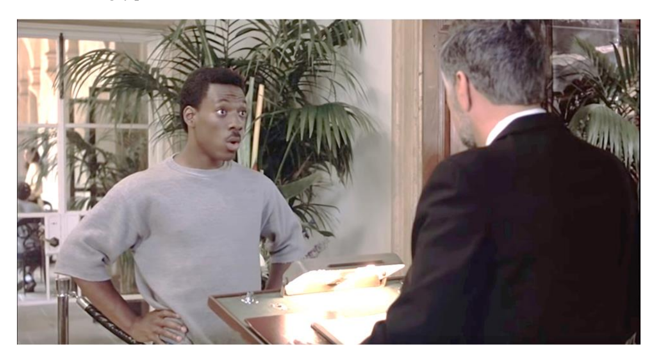
Figure 3. Beverly Hills meets "Ramon"

The third scene inspected by this writing occurs in the city of Beverly Hills, at an elegant "white tablecloth" restaurant. Foley needs to reach the film's antagonist, Victor Maitland, at his dining club, but anticipates being refused entry based upon his otherness, a condition lodged in reductive differences of race, class, bodily presentation (which includes his sweatshirt, jeans and Nike shoes), and non-membership. At the restaurant entrance, realizing that he will be denied the privilege of entry, Murphy-as-Foley challenges the denial and the straight hegemonic male gaze of the restaurant's icy maître d'. To subvert the denial and indifference to his presence, Murphy accesses the trickster's shape-shifting talent and literally slips into a gay persona, right in front of the audience's eyes (Figure 3). The audience has seen this trick before. It is a well-known part of Murphy's standup routines and television work, and highly discussed by the star's fans. And there are many people attending the R-rated film, waiting and watching, just to see it happen