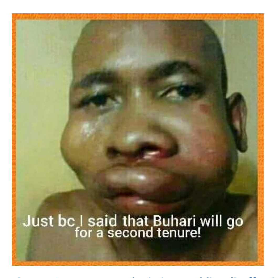
Figure 2 A meme depicting public disaffection for the President