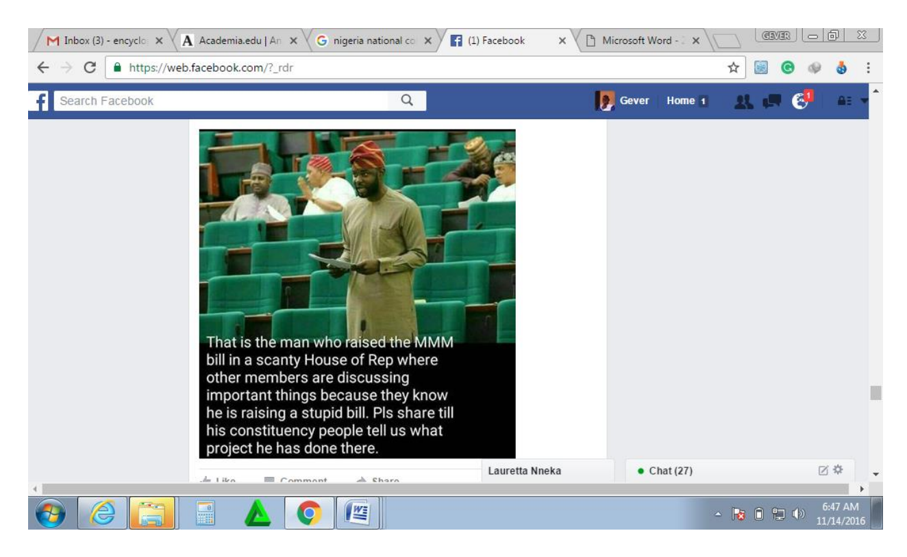
Figure 5 A real picture showing disaffection to a Rep member over his contribution on the flour of the House