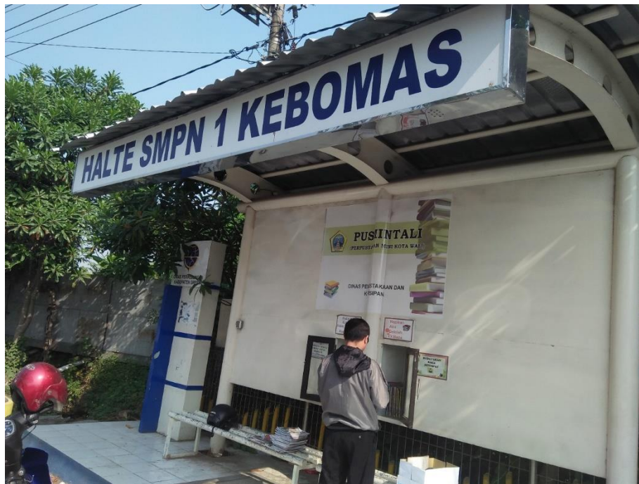
Picture 1. One of eight Pusmintali services in bus stop SMPN 1 Kebomas