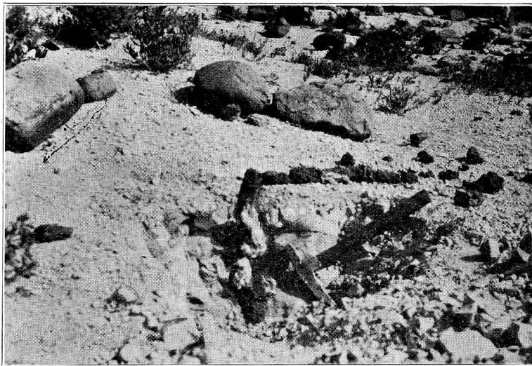
Fig. 22. A manganese fulgurite, partly exposed. Chugwater Creek, Wyoming.