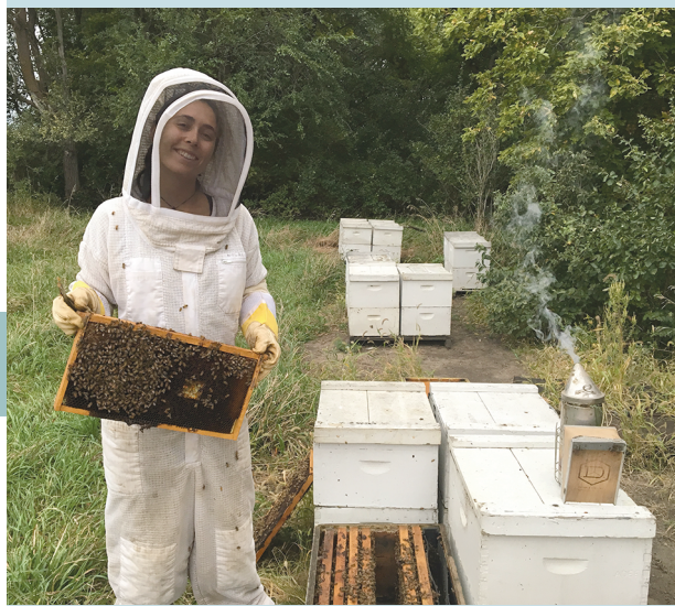
A commercial bee yard on CRP grasslands in North Dakota. This bee yard was used as part of a USGS pollinator health assessment project in North Dakota, South Dakota, and Minnesota.