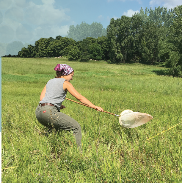
USGS biologist sampling honey bees and native bees on CRP grasslands in North Dakota.