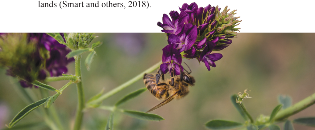
Below left: A honey bee ( Apis mellifera) on alfalfa ( Medicago sativa). Below right: Honey bees ( Apis mellifera) carrying pollen to the hive. Top: Bees on honeycomb.