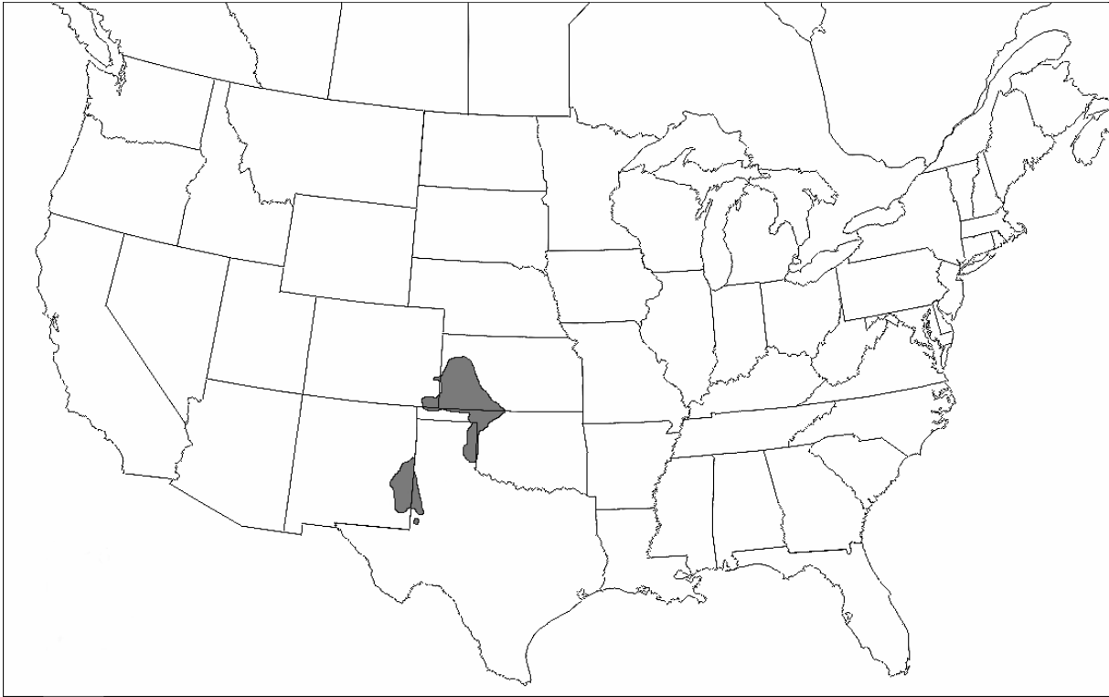
Figure. Shaded area represents the distribution of Lesser Prairie-Chicken. Information courtesy of K. M. Giesen, Colorado Division of Wildlife, Ft. Collins, Colorado.

Key to management is maintaining expansive shinnery oak ( Quercus havardii ) or sand sagebrush ( Artemisia filifolia ) grasslands. Within these grasslands, provide areas of short herbaceous cover for lek sites, shrubs or tall residual grasses for nesting, and areas with about 25% canopy cover of shrubs, forbs, or grasses 25-30 cm tall for brood rearing. Historically, the Lesser Prairie-Chicken was considered a gamebird and was hunted throughout its range; currently, it is hunted only in Kansas and Texas. The following account does not address harvest management, but instead focuses on habitat management.