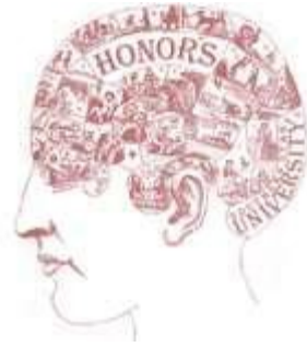
Figure 2: Honors Program Logo (“SUU Honors Program”)

In addition to the motto, the Honors Program attempts to gain a collective grouping through the development of a branding or logo; unfortunately, the logo does not have the same effect as the motto. Southern Utah University’s Honors Program developed a logo featuring a human head from the neck upward. Within Figure 2, the logo depicts many different thoughts, with the word “honors” presented clearly in the center. Even though this logo is extremely stimulating to the eye, the picture’s busyness sets the viewer on edge, making it not the ideal choice in a logo. The lack of visual pleasantries results in members failing to identify with the logo, causing a rift between the program and individuals. Through utilizing a more simplistic and classy logo, the honors program would find more fluidity between the motto and their logo, allowing for a stronger picture of the SUU honors student.